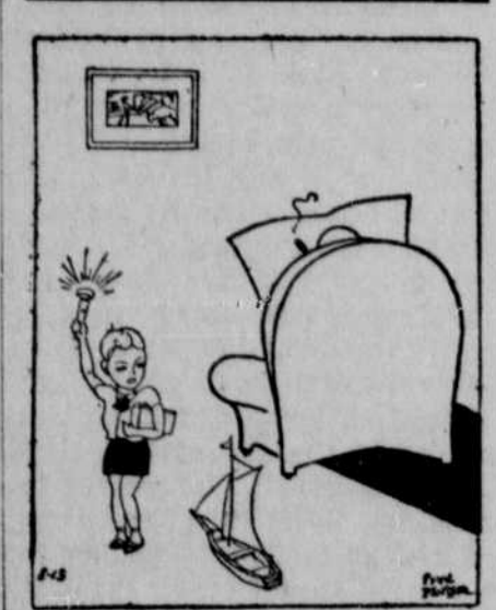
Pop, what is a lion?"