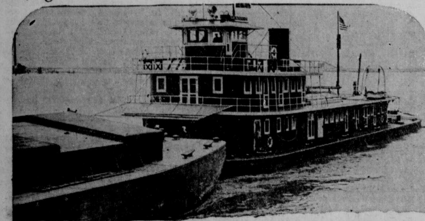
After a lapse of twenty years barge service for freight has been resumed on the Missouri river between St. Louis and Kansas City. The photograph shows the Federal barge line boat Franklin D. Roosevelt and its tow, as it started the service.