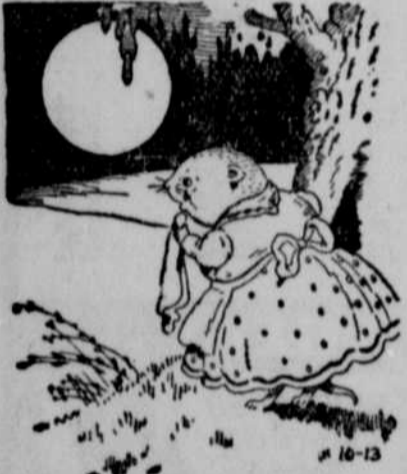
He Certainly Must Be Dead; Nanny Was Sure of It.

THE silvery light of sweet Mistress Moon flooded the Green Meadows and chased the Black shadows clear back to the very edges of the Green Meadows. It was just such a night as a Meadow Mouse loves, and Nanny Meadow Mouse would have enjoyed it and rejoiced in it and been thoroughly happy but for one thing. The truth is, Danny Meadow Mouse had spoiled that beautiful night for Nanny Meadow Mouse. He didn't know he had, but he had. You see, Nanny was worried and her worry