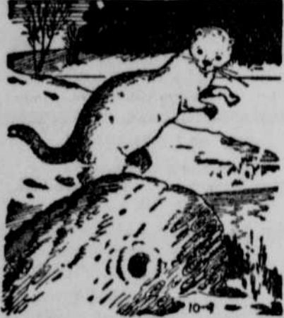
"You'll Have to Come Out Some Time and I'm Going to Stay Right Here and Wait for You," Declared Billy Mink.

DANNY MEADOW MOUSE was trapped. He was trapped, but not caught, which sounds rather mixed and isn't at all. You see he was trapped because Billy Mink was waiting for him just outside the only doorway to that hollow log in which he was hiding. But he wasn't caught, because that doorway was too small for Billy Mink