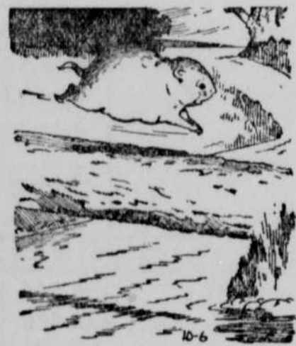
Then He Scampered Across and Gave a Tiny Sigh of Thankfulness.

Of Billy Mink, Snapper the Turtle and the Big Pickerel he could see nothing at all and rightly guessed