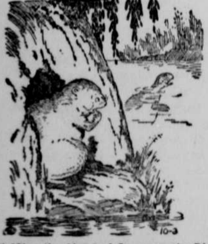
It Was the Head of Snapper, the Big Snapping Turtle.

WHEN Danny Meadow Mouse crept into the little hole in the bank of the Smiling Pool his heart was beating so fast that it didn't seem to him he would be able to move again for a long time. You see, crossing the Smiling Pool was a long swim for such a little fellow as Danny Meadow Mouse. He had not been in the water for a long time before, and so of course swim-