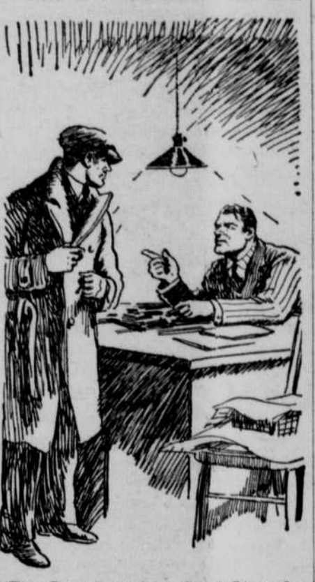
Pool Room's a Good Place for You to Be, Limpy."

discover what sort of man is standing between me and poverty,"-per- PRETTY WORK IN haps ironically, this. "And, of course, I knew you weren't lost."