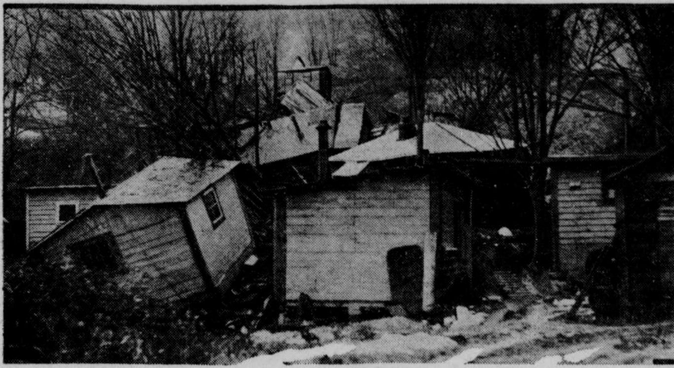
When a half dozen houses try to occupy the same building lot it's just too bad. The fast melting snow on Beacon Hill, Seattle, washed down over the sides of a colony of cliff dwellers and moved six or eight houses into one small space.