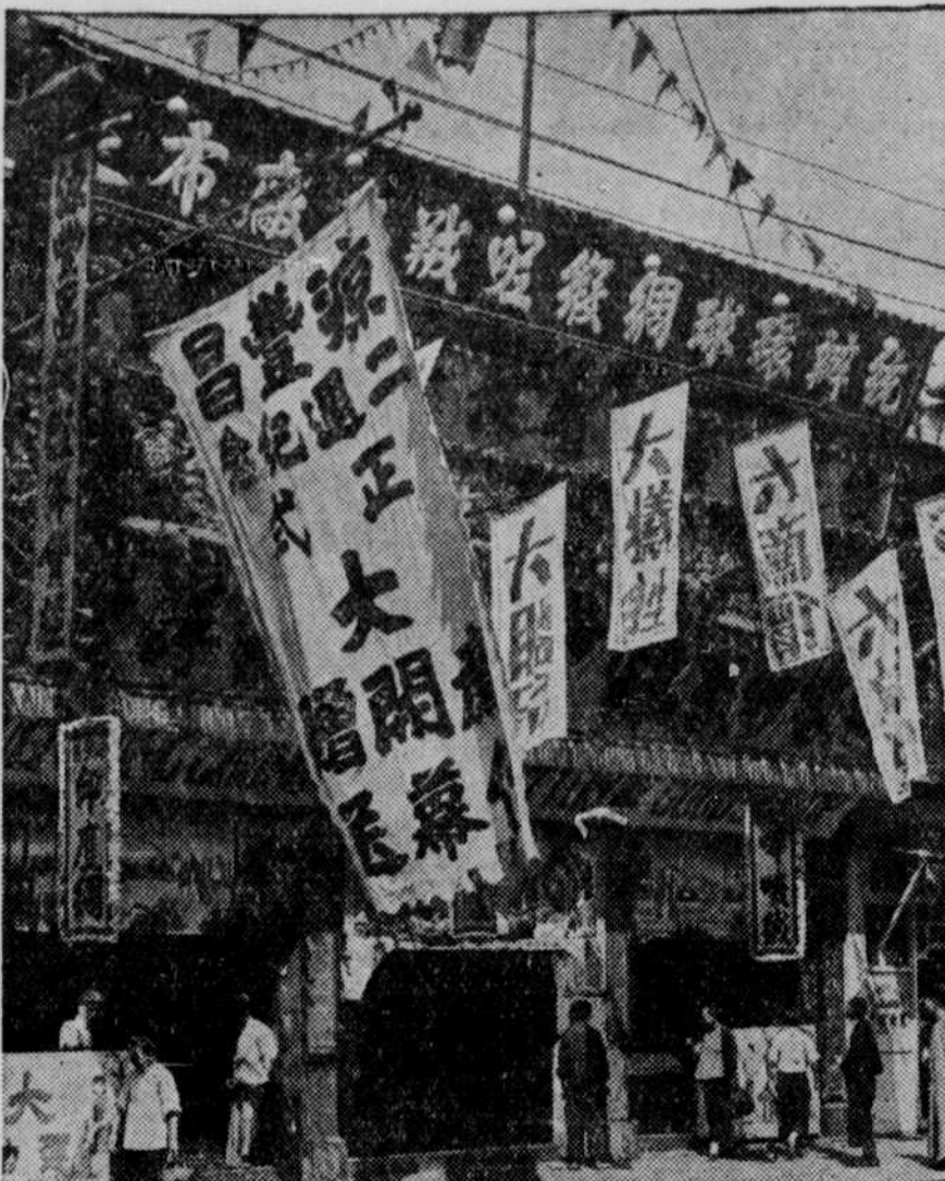
Bargain Day at a Shanghai Shop.

Prepared by National Geographic Society, Washington, D. C.—WNU Service.