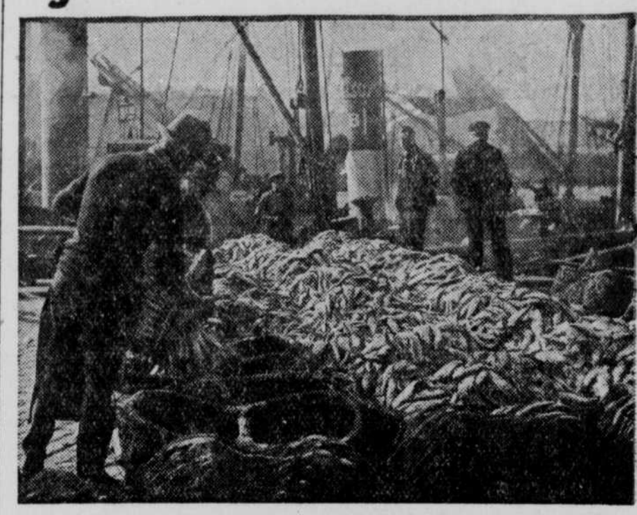
Herring Is King at Yarmouth.

Prepared by National Geographic Society. | for direct export. The Scottish Washington, D. C.—WNU Service. TARMOUTH, England, is in-