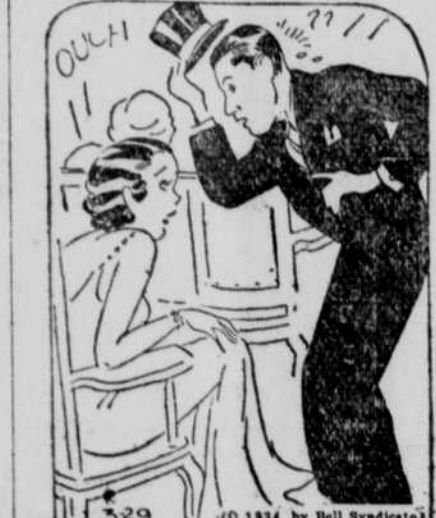
The girl chum says it's queer that nobody has devised step-on insurance for people who buy aisle seats at the theater.