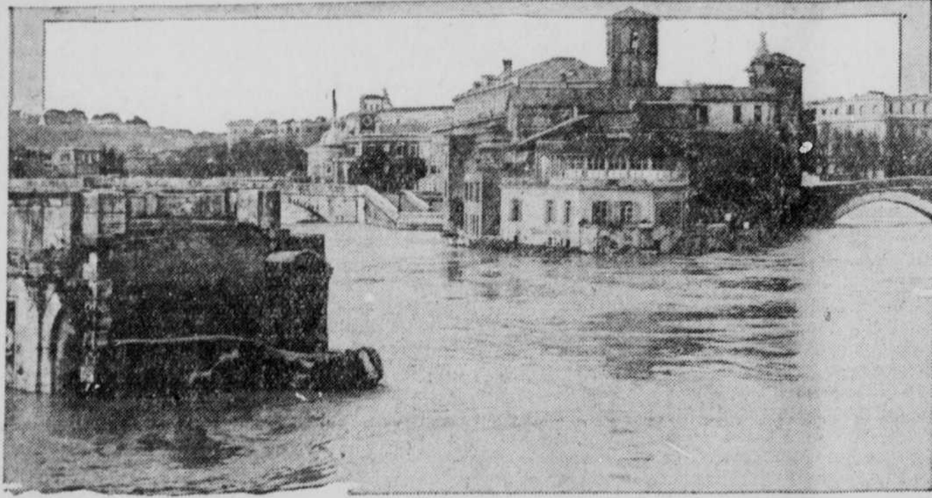
RECORD-BREAKING rains in the mountains of central Italy recently caused the yellow Tiber to overflow its banks, the river reaching its highest point in many years. This view was taken at Rome during the flood, which caused much distress.