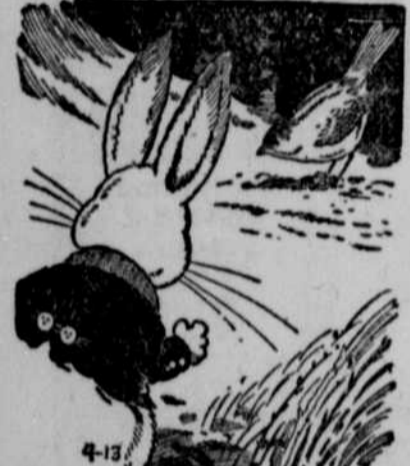
"Are you going to spend the winter here, Snowflake?" cried Peter.

ROUGH BROTHER NORTH WIND hurried up one big cloud after another, and late in the afternoon white, feathery flakes came drifting out of the sky. Peter Rabbit sat tight in the dear Old Briar Patch. All night he remained squatting just inside the entrance to an old hole Johnny Chuck's grandfather had dug a long time ago in the middle of the dear Old Briar Patch. Some time before