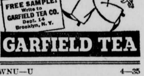
FREE SAMPLE! Write to GARFIELD TEA CO., Dept. 14, Brooklyn, N. Y. WNU—U 4-35

Don't let a sluggish overworked system hold you back. CLEARSE INTERNALLY WITH GARFIELD TEA. Get rid of the wastes that slow you up and keep you feeling run-down and inactive. Usually works within 8 to 10 hrs. MILD but prompt! At drug stores 25c & 10c.