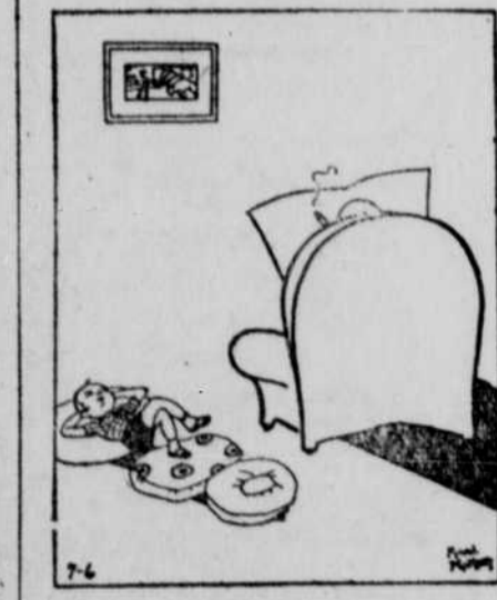
"Pop, what are icicles?" "Winter's beard."