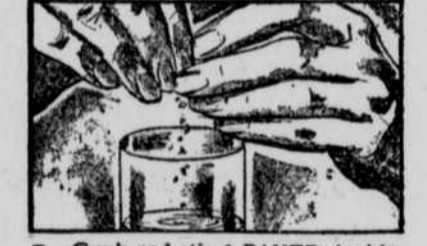
1. Crush and stir 3 BAYER Aspirin Tablets in a third glass of water.