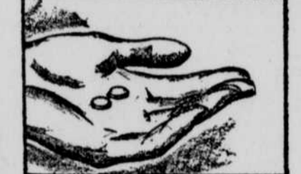
3. If you have a cold, take 2 BAYER Aspirin Tablets. Drink full glass of water. Repeat if necessary, following directions in package.