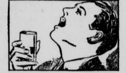
2. Gargle Thoroughly—throw your head way back, allowing a little to trickle down your throat. Do this twice. Do not rinse mouth.