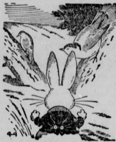
"Hello! There's Seep Seep."

he tucks his nest made of twigs, strips of bark and moss. He's a funny little fellow, and I don't know of anyone in all the Great World who more strictly attends to his own business than does Seep Seep the Brown Creeper. He's little but he is mighty useful. Farmer Brown ought to be glad every time he sees him. By the way, Peter, have you seen anything of Dotty the Tree Sparrow?"