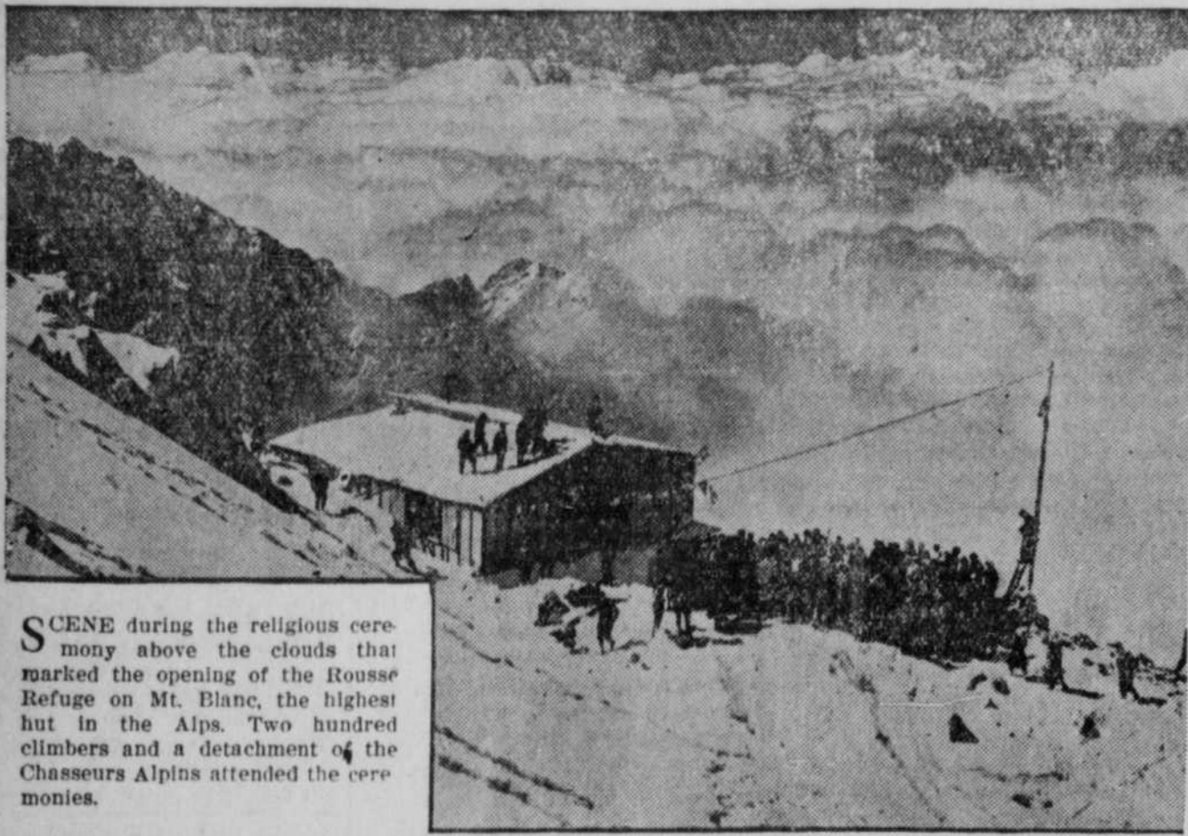
SCENE during the religious ceremony above the clouds that marked the opening of the Rousse Refuge on Mt. Blanc, the highest hut in the Alps. Two hundred climbers and a detachment of the Chasseurs Alpins attended the ceremonies.