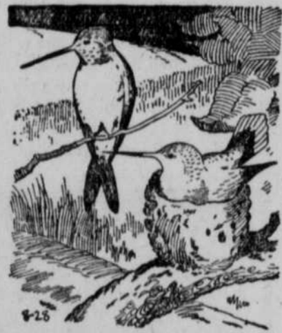
It Was Their Nest.

in midair as he thrust his long bill into the heart of a flower to get the tiny insects there and the sweet juices he is so fond of. But this was the first time Peter had ever seen him sitting still. He was such a mite of a thing that it was hard to realize he was a bird. His back was a bright shining green. His wings and tail were brownish with