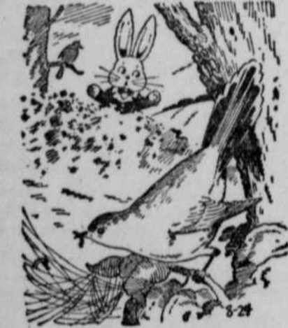
Cuckoo Made No Sound, But Began to Pick Off the Hairy Caterpillars.

how a bad name sticks. The Cuckoos have been accused of stealing the eggs of other birds, but I've never known them to do it, and I've lived neighbor to them for a long time. As a matter of fact they are mighty useful birds. Farmer Brown ought to be tickled to death that Mr. and Mrs. Cuckoo have come back to the Old Orchard this year. Do you see that cob-webby nest with all those hairy caterpillars on it and around it up in that tree?" Peter replied that he did, and that he had seen a great many nests just like it and had noticed how the caterpillars ate all the leaves near them. "I'll venture to say that you won't see many leaves eaten around that nest," replied Kitty. "Those are called tent caterpillars and they do an awful lot of damage. I can't bear them myself because they are so hairy. Very few birds will touch them. But Cuckoo likes them. There he comes now; just watch him." A long slim, dove-like appearing bird alighted close to the caterpillars' nest. Above he was brownish gray with just a little greenish