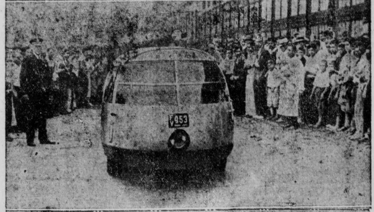
This bullet-shaped vehicle, mounted on three wheels, port, Conn., test. It is 18 feet long, weighs 1,700 and known as the Dynmaxion, is pictured at Bridge- pounds, and can speed at 120 m. p. h.