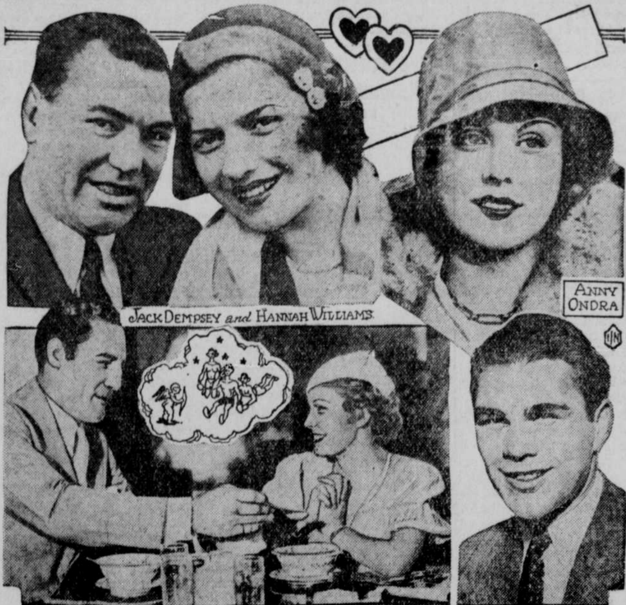
JACK DEMPSEY and HANNAH WILLIAMS