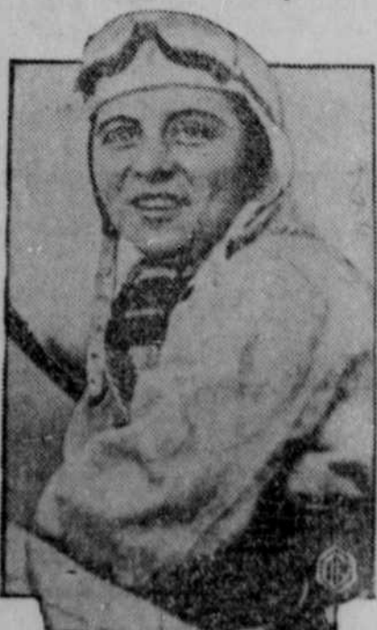
Although Elli Beinhorn, of Berlin, could win laurels with her beauty in any bathing belle competition, she chose instead to seek fame in the air. She is shown here after she was awarded the Hindenburg Cup for outstanding flying feats with a light motored craft. The trophy is one of the most highly prized among German fliers.