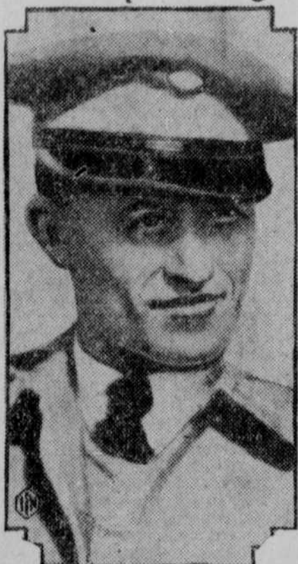
Hurting his speed seaplane over Lake Garda, Italy, at the terrific velocity of 426.5 miles an hour, more than 7 miles a minute, Flight Officer Francisco Agello, who was a member of Italy's 1929 Schneider Cup team, broke the world's record and won the distinction of having traveled faster than any other human being has ever done. The previous record of 408.997 miles an hour was held by Lieutenant George Stainforth, of Great Britain.