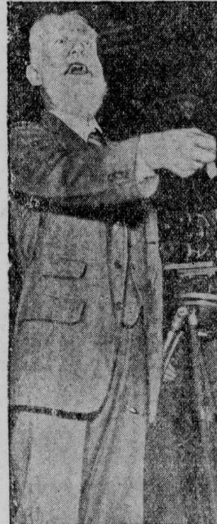
Thinking that all the pictures had been taken because the kleig lights were turned off, George Bernard Shaw, Irish dramatist, struck this pose when photographers complained that he did not put enough action in his stance. "I suppose you'd like me to pose like this," sez G. B. S. "Thank you, Mr. Shaw," sez our photographer. And was G. B. S. chagrined!