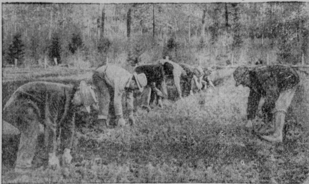
Here is the scene at Wind River, Wash., where the reforestation program of President Roosevelt is in full swing. A group of erstwhile unemployed is shown pulling up two-year-old fir trees for shipping to various parts of the nation for transplanting. It is expected that nearly 250,000 men will be at work on the project before the middle of May, as enlistments continue to increase.