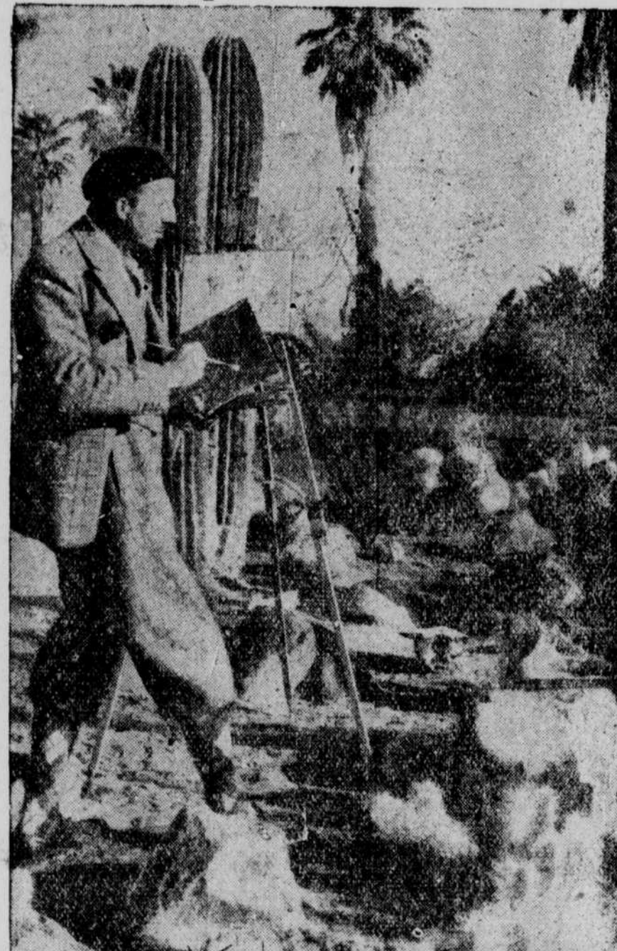
Dean Cornwall, celebrated artist, working on the world's largest series of murals, is shown sketching in the California desert for the twelfth and last of the huge paintings. The last painting will be forty feet square and its completion will mark the end of a task that has taken five years. The murals are for the Los Angeles Public Library.