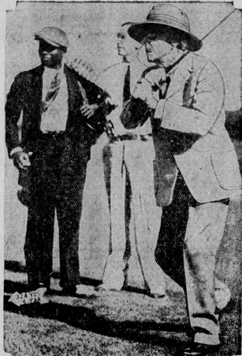
Despite his 93 years, John D. Rockefeller, oil magnate, can still get distance with his driver. The aged financier is shown here during his first game of the season at Ormond Beach, Fla., where he invariably spends the Winter. The drive made by Mr. Rockefeller as this picture was made went off the fairway and almost landed in his automobile.