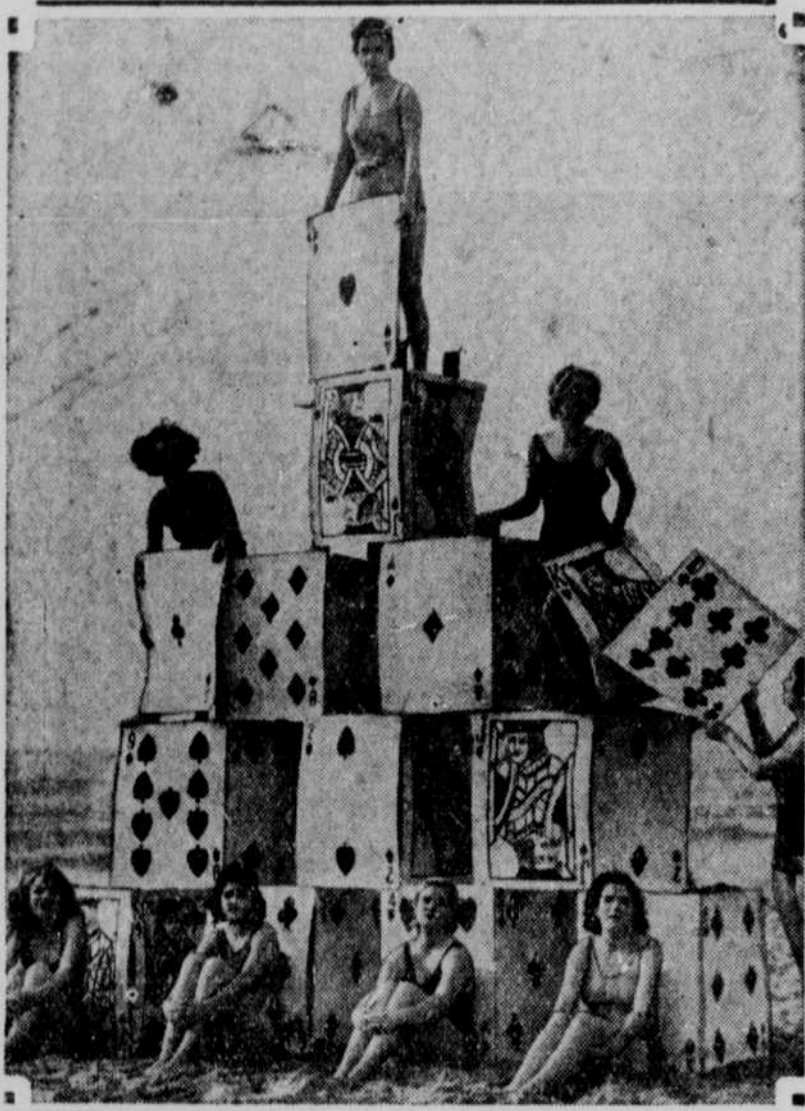
With a huge deck of playing cards, these bathing beauties on the beach at Venice, Cal., build a giant house of cards—a house so firm on its foundation of sand that the Pacific's best breeze can't blow it down. In the true feminine manner, you will notice they have placed the heart at the very peak.