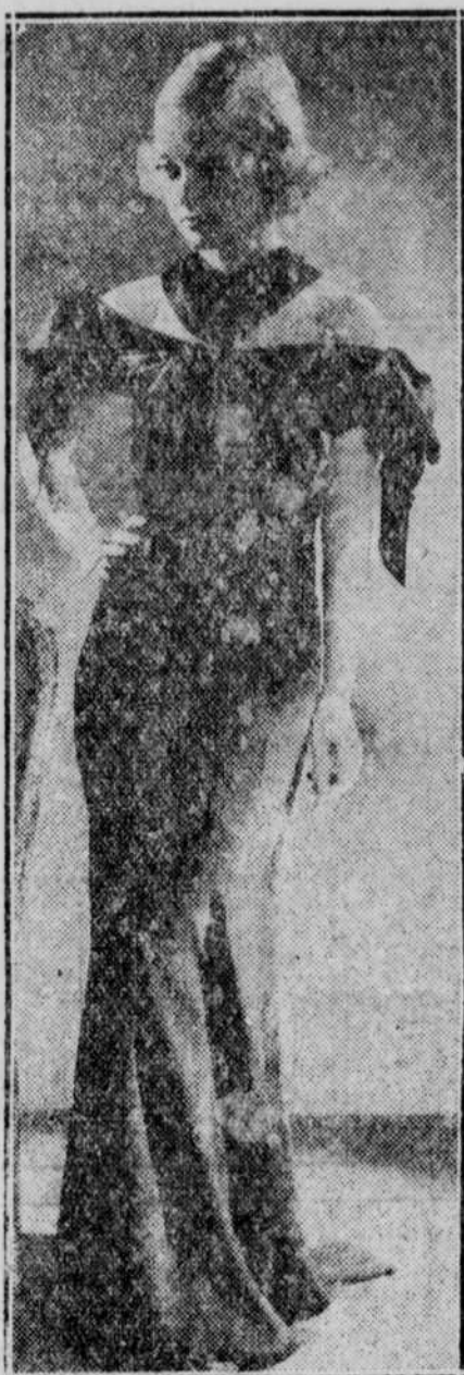
Created by a Hollywood designer, this lovely evening gown worn by Bette Davis, screen player, is striking in novelty of design. It is of black satin and features a distinctive neckline, a variation of the halter type, with large loop bows emphasizing the dropped shoulderline.