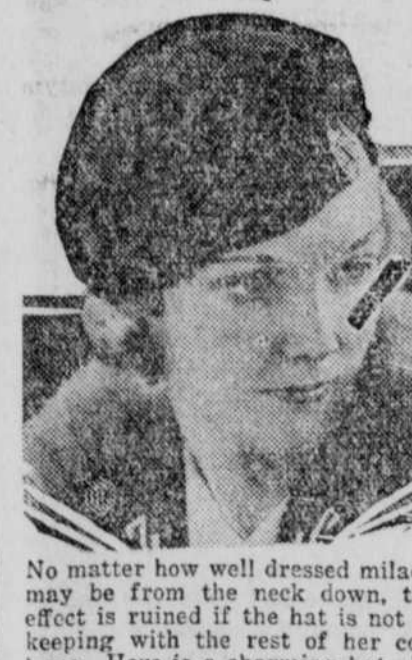
No matter how well dressed milady may be from the neck down, the effect is ruined if the hat is not in keeping with the rest of her costume. Here is a charming hat, designed to go with the new Fall styles. It has a stitched crown and brim, accentuating the backward movement and held on the side with a marcasite ornament.