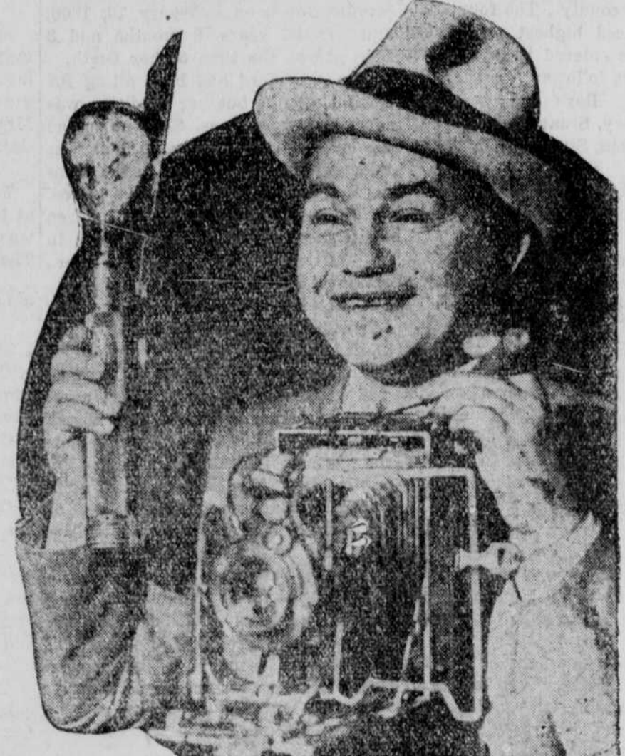
Edward G. Robinson, movie gangster hero, is shown as he snapped the snappers when photographers ambushed him on his arrival at New York from the West Coast. This is one of the few times that a movie player has discovered a new way to pose for the lens men. But then Robinson isn't happy unless he's shooting at something.