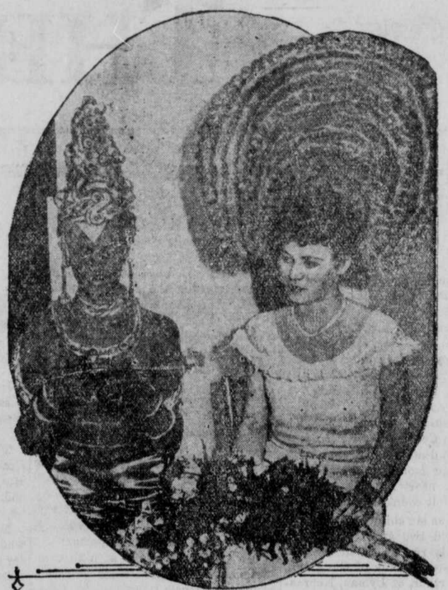
Woman's crowning glory, they call it. And now you know the reason. Here are two examples of hair-dressing that won first and second prize in "fantasy competition" at a London, Eng., hair fair recently. The coiffure at left is entirely of gold hair, the creation of an African native. That on the right is called the "peacock."