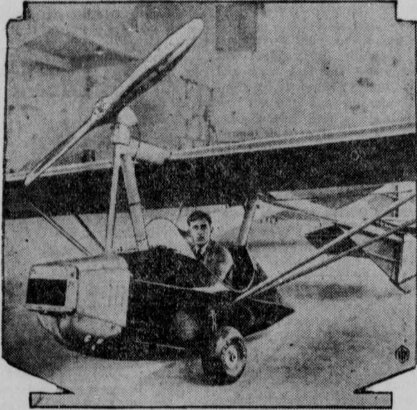
It has come at last. Now you may buy a plane that you can take home and park in the clothes closet when you're not using it exploring the clouds. The model shown here was exhibited at a recent air show in Berlin, Germany. It is sold to the customer, with fuselage, propeller and motor attached, but the wings and tail must be adjusted by the airman himself. Packed, it takes up no more room than a medium-sized trunk.