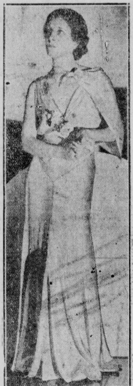
Grecian simplicity marks the lines of the evening frock worn here by Diane Wynyard, M-G-M actress. It is of blue white crepe and fashioned in the new silhouette. Two white gardenias are pinned to the front of the V-neckline. A kerchief scarf ties around the throat as a wrap.