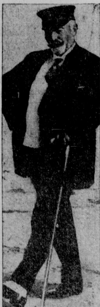
Something of a fashion plate is the former Kaiser Wilhelm of Germany, shown as he strolled on a beach near Doorn, Holland. The ex-ruler is attired in a jaunty vacation costume comprised of a swanky yachting cap, pull-over sweater and pearl-buttoned spats.