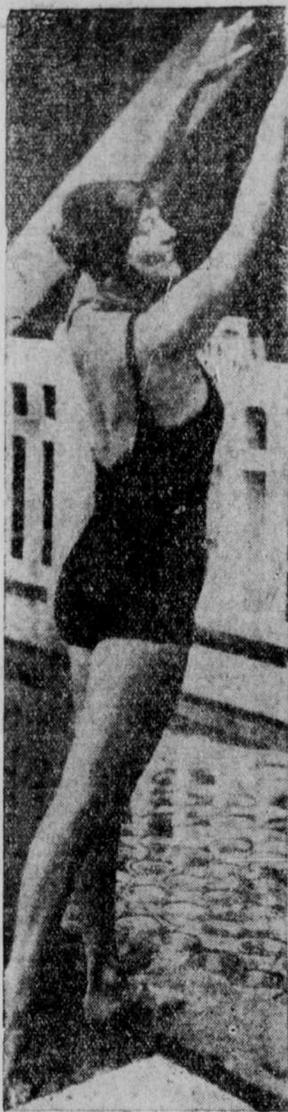
Internationally famous as a diving girl two decades ago, Annette Kellerman, who was the sensation of the day with her aquatic acts on the stage, is shown during her comeback debut in Paris. The star, though a little more rounded by nature, is as graceful as ever.