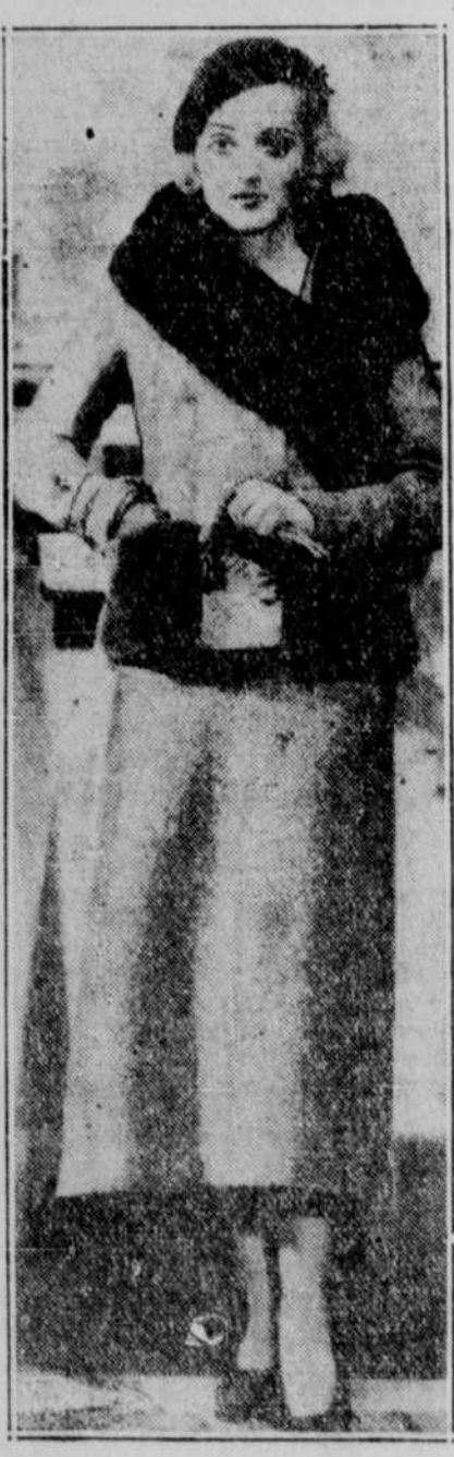
Straight from Hollywood comes this ultra-smart ensemble for fall and early winter. Bette Davis, screen actress, is wearing a suit of brown tweed with lei collar and patch pockets of beaver. Her hat is of brown transparent knit velvet, edged with veils of brown and green felt.