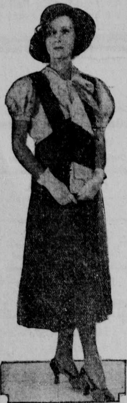
Youth is personified in the strapped skirt and puffed-sleeve blouse worn here by Dorothy Jordan, M. G. M. player. The blouse is of white barred voile, while the skirt is of brown linen. The hat is of brown felt with strapped slippers also of brown. Gloves and purse are white.