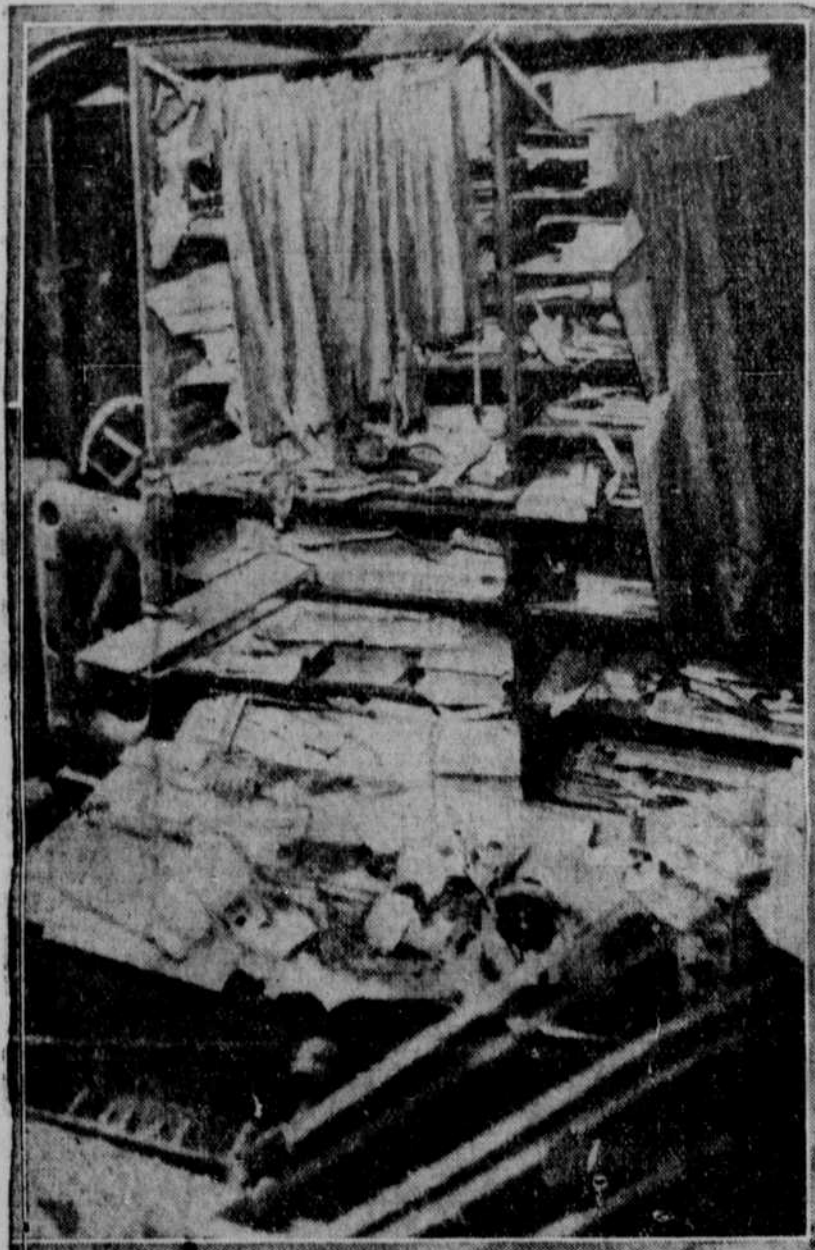
City newspaper men always dream of the day when they can have a little country paper of their own, on which they can pass the balance of their lives in peace and quiet. Well, here's what happened to the Taylorville, Ill., Daily Breeze office when a bomb was heaved into it. The outrage is said to be the outcome of the mine disturbances.