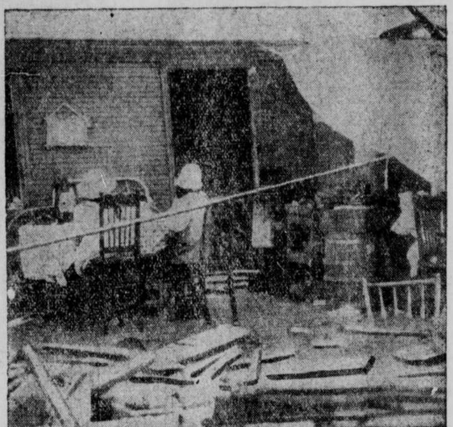
Here is a touching picture from the scene of the recent disastrous hurricane which, with tropical rapidity, descended upon Abaco Island, Bahamas. Houses were whipped up and blown clear away by the big wind, which caused ten deaths besides enormous property damage. But house or no house, kids must eat, so the little family above sit calmly down to a meal in the wreckage of their home.