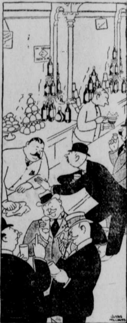
Do You Remember—?

"The usual ensemble was about as follows: "A soiled tablecloth. A stack of eye bread spotted with caraway seed. A platter of sliced 'baloney' full of pepper. A bouquet of spring onions.