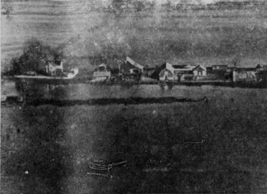
SPRING IS HERE — FLOODS, TOO . . . More than 2,000 acres of valuable farm land were inundated by heavy rains and melting ice and snow throughout the Rock river area near Moline, Ill. Property damage was extensive and spring planting was delayed, keeping fertile fields out of production until they were dried up.

W. F. Finley, M. D. OFFICE PHONE: 28 First National Bank Bldg. O'NEILL