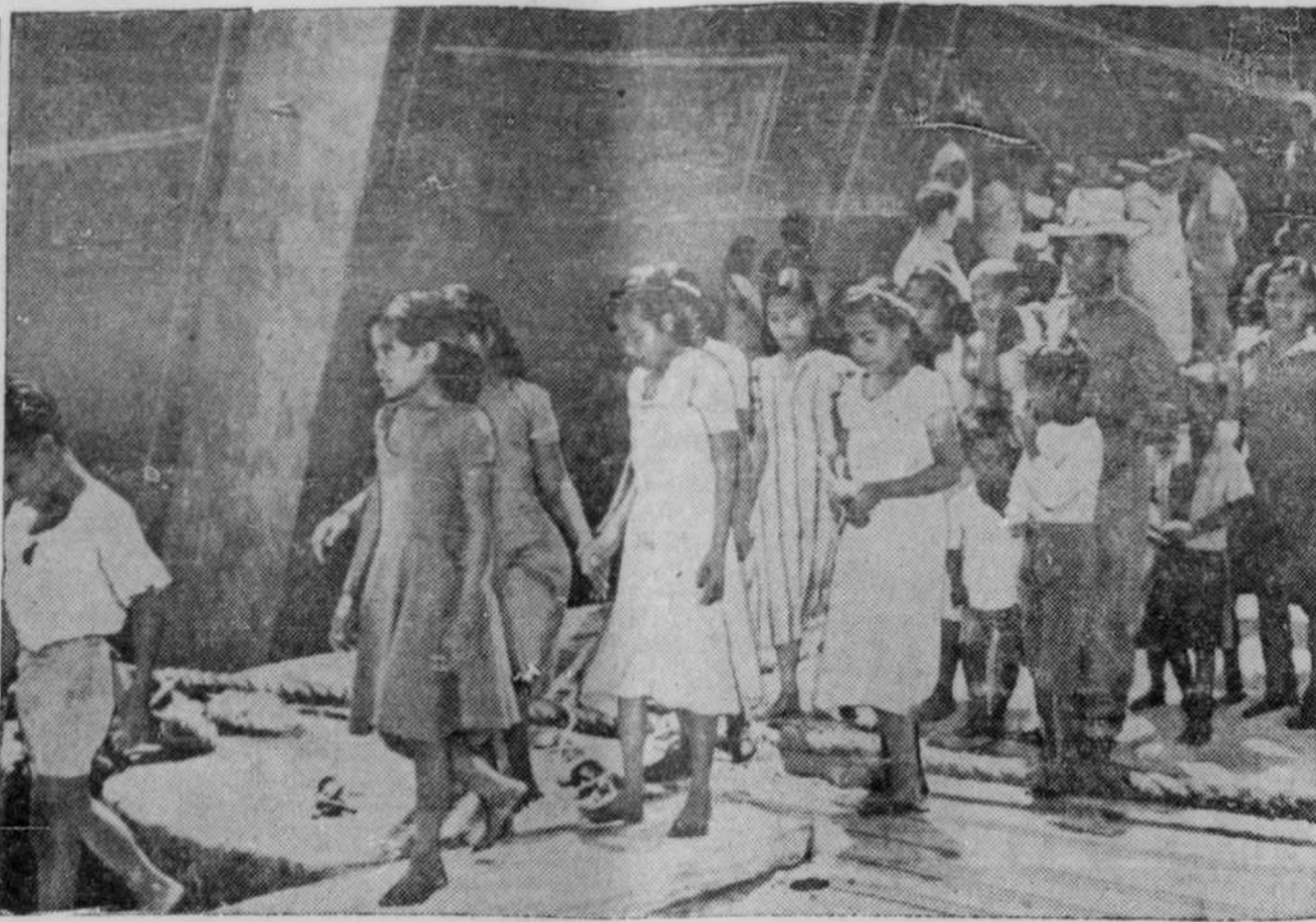
BIKINI EVACUEES MAKE ANOTHER MOVE . . . Evacuated from Bikini atoll when the U. S. armed services were conducting "Operation Crossroads" with the atomic bomb, these Bikini natives lived for the past two years on the island of Rongerik. They found conditions unsuitable, however, and asked to be moved. Here, some of them are leaving a

ship at Kwajalein, their new home. Apparently each move they make brings them a step closer to civilization. In contrast to their former habit, all now wear clothes. Kwajalein is to be only a temporary home for these Pacific nomads until a permanent one can be found.