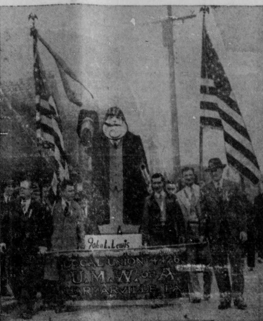
THE GREAT MAN MARCHES IN EFFIGY . . . John L. Lewis took part in the parade that marked "John Mitchell Day" at New Kensington, Pa., but he didn't quote once from Shakespeare or rage grandiloquently at the Taft-Hartley act. He was there only in effigy as a member of the Hamarville delegation. John Mitchell, incidentally, was the UMW president who first won the 8-hour day for miners.