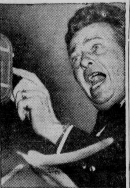
VEHEMENT . . . Addressing the annual Lincoln day dinner in Washington, Rep. Everett M. Dirksen (Rep., Ill.) said that American democracy and world communism "can dwell together only if we are ready to let freedom perish from the earth."