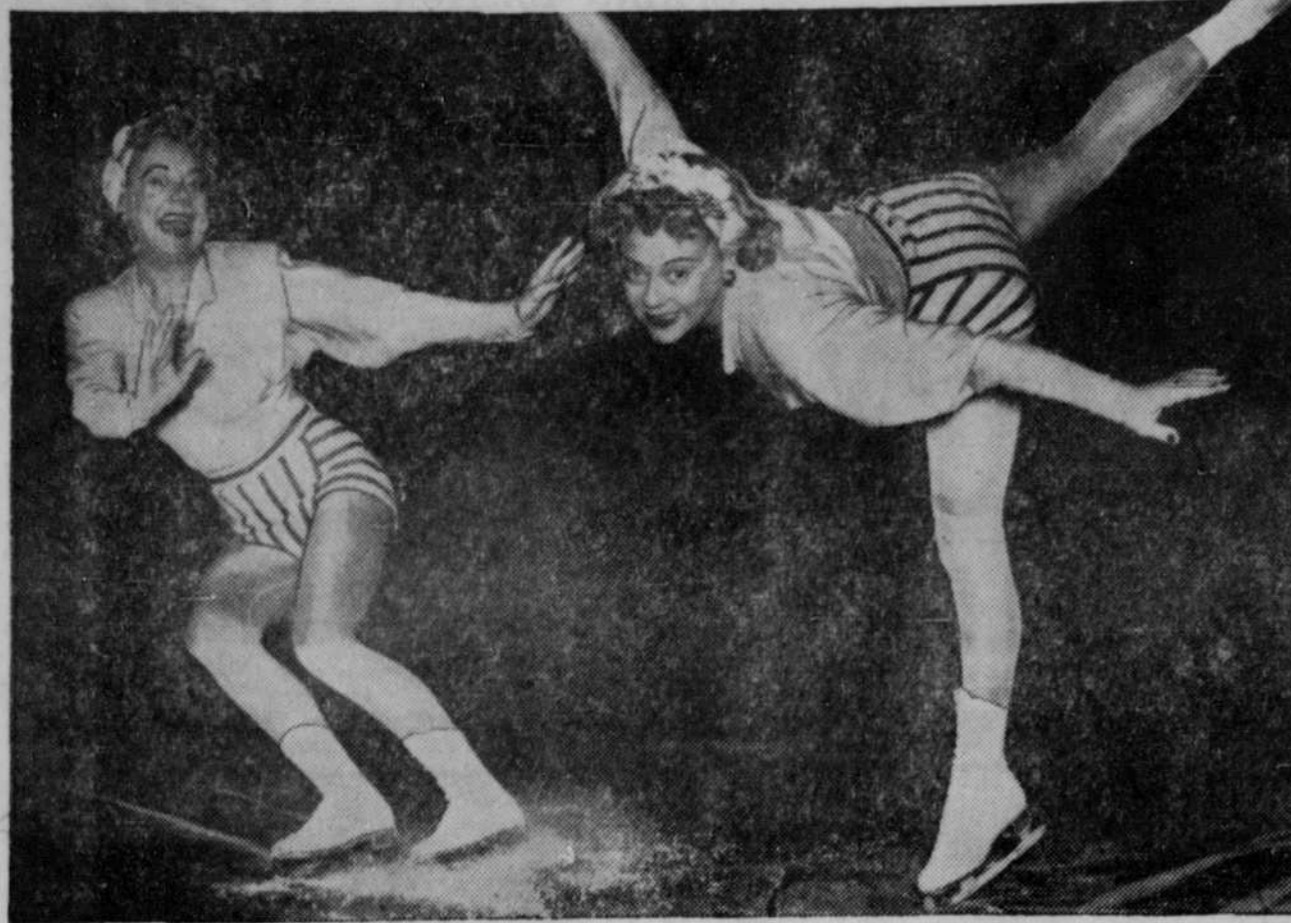
TWO FOR THE PRICE OF ONE . . . No, Sonja Henie doesn't have a twin. This picture is a double exposure on one film catching the ice queen in a couple of action poses from one of her fast skating routines. The reason this photograph is unusual is that it's hard enough to corral Sonja once on a film, much less twice. She was practising for opening of her Hollywood ice revue at Madison Square Garden, New York City.