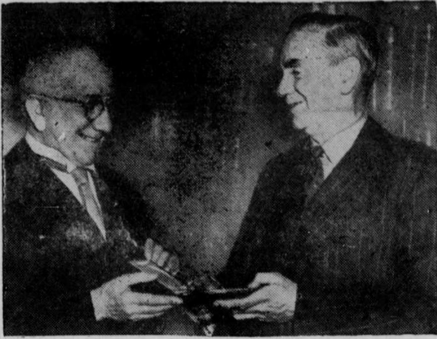
HE'S THE LEADER OF THE IRISH... John A. Costello (right), newly elected prime minister of Eire, is presented the seals of his office by Sean T. O'Kelly, president of Eire, in an unobtrusive ceremony in the library of the president's house. A 6-party coalition which swept into control of the Irish assembly elected Costello premier and defeated the perennial Eamon de Valera who had been in office for 16 years.