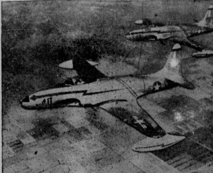
CANAL ZONE GETS JETS . . . U. S. air force's 36th fighter group, out of the defense units for the Panama Canal zone, has completed its conversion from the wartime P-47 aircraft to jet-propelled P-80 Shooting Stars. These P-80's are shown enroute to their home station, Howard air force base in the canal zone where they will become an integral part of the canal's defense system.