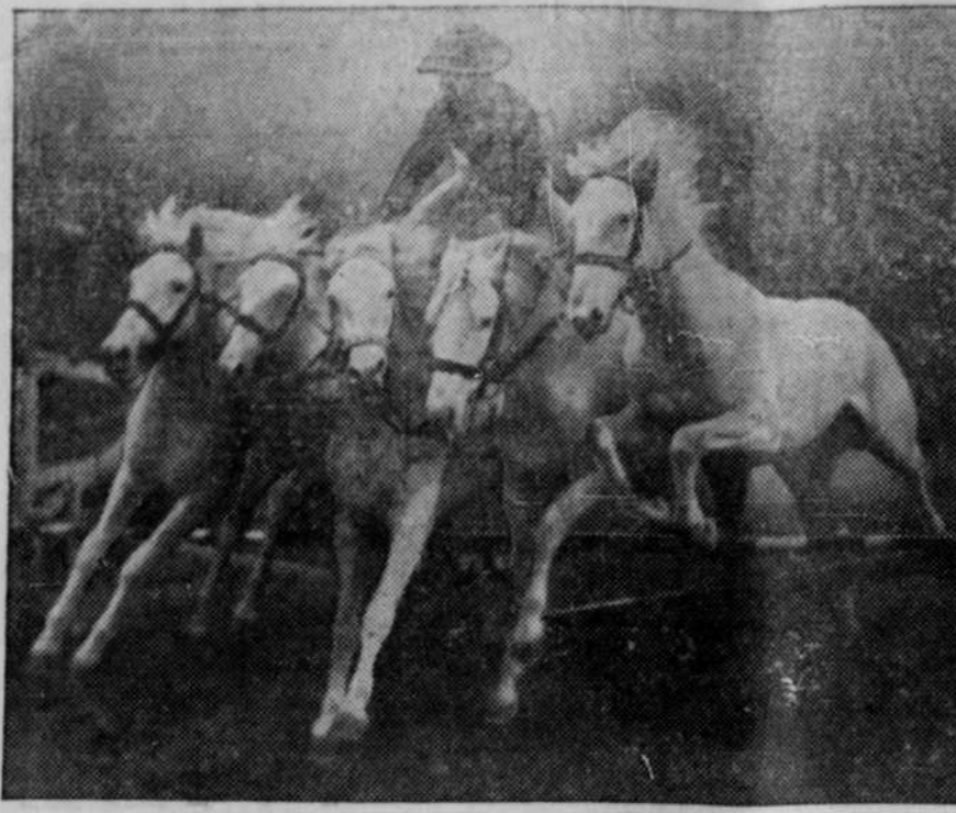
ALBINOS OVER THE HURDLE

Sen. Arthur Capper, 82, (Rep. Kas.), has opened a drive in congress to outlaw advertising of alcoholic beverages. He stated that liquor ads are driving "hordes" of persons to drink.