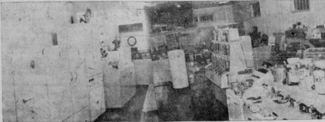
Interior of Our New Store

"... to provide the O'Neill vicinity with the finest in home appliances and radio repair service."