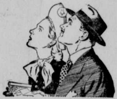
MR. & MRS. PASSENGER