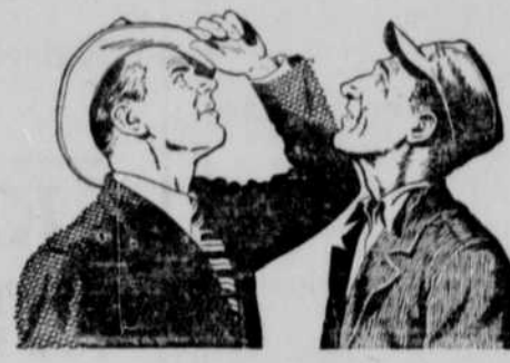
MR. SHIPPER & MR. FARMER