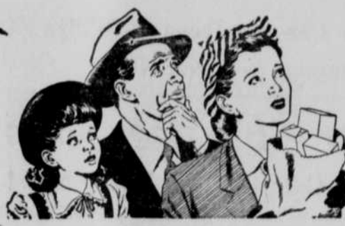
MR. & MRS. CONSUMER