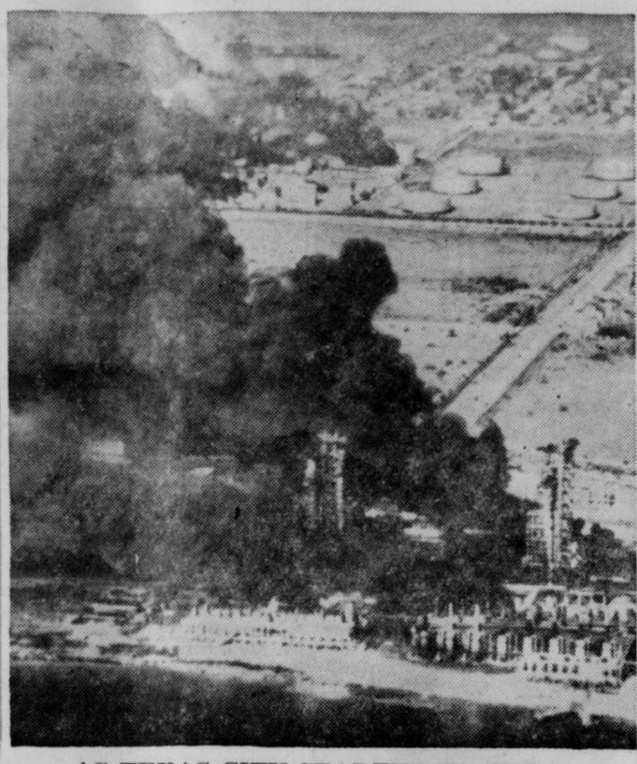
AS TEXAS CITY STARTED TO BURN