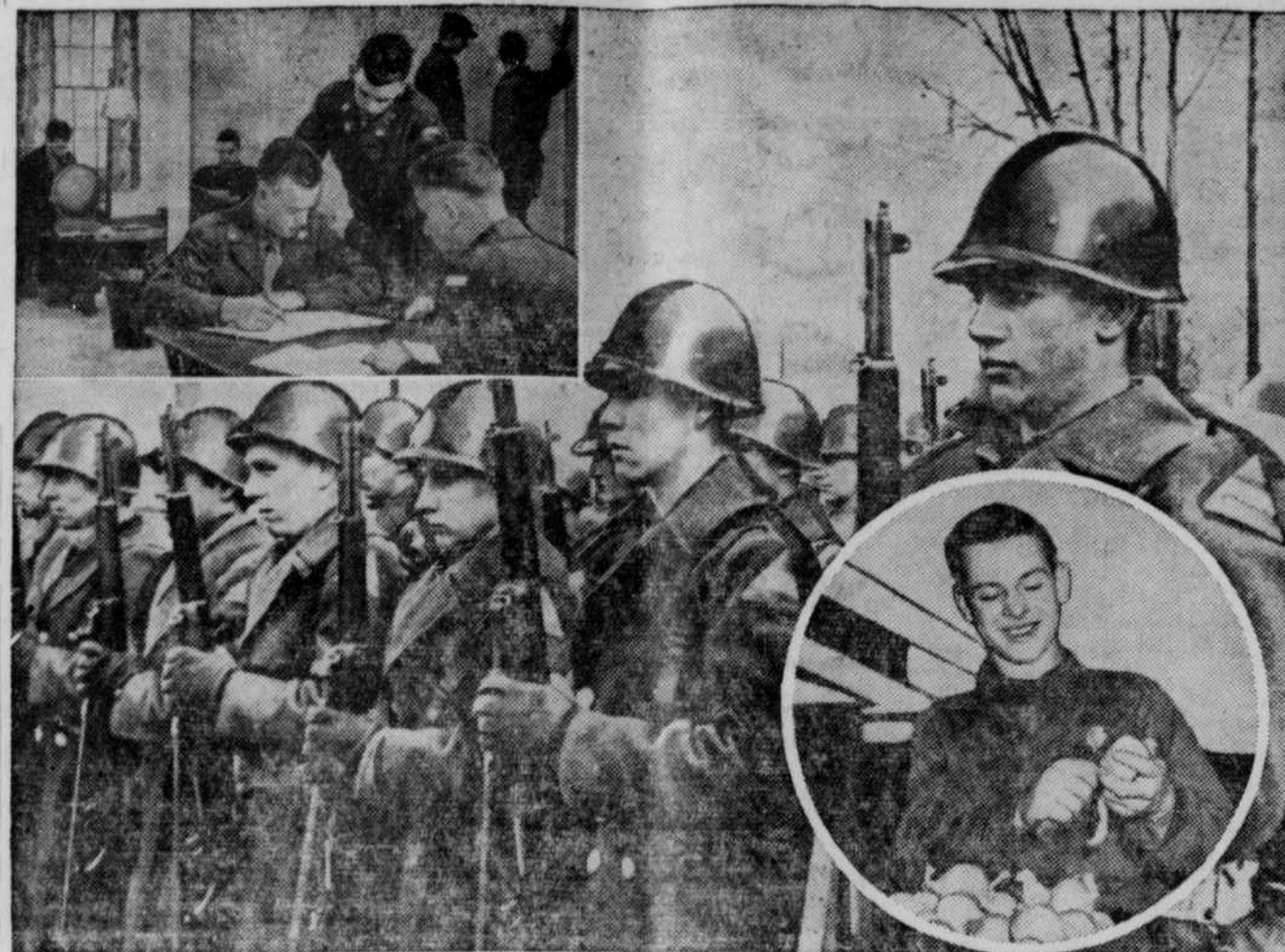
ARMY GUINEA PIG REGIMENT AT FORT KNOX

More than 650 boys, under 19 years of age, from all parts of the country, are volunteers at Fort Knox, Ky., in an experimental universal military