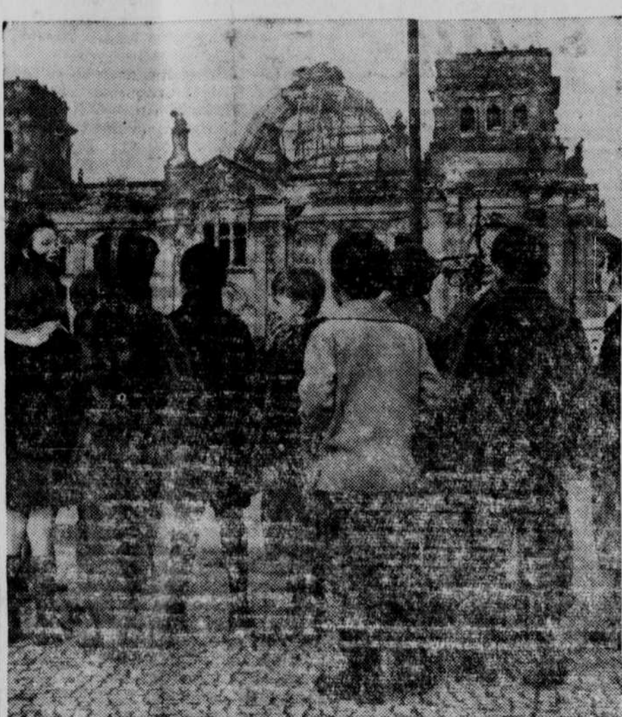
AMERICAN KIDS IN GERMANY

Children of American army personnel are looking at the ruins of the German Reichstag which might now serve as the tombstone for the Nazis hopes of world domination. It was