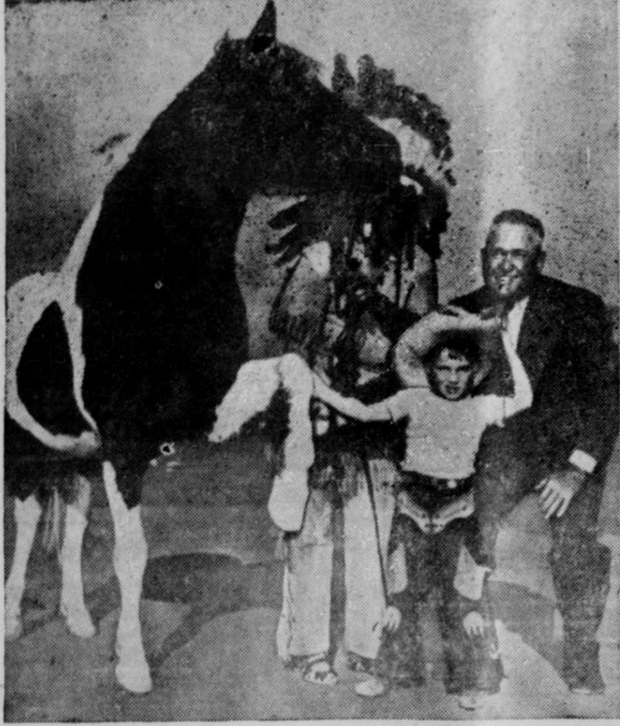
COWBOY MEETS INDIAN CHIEF