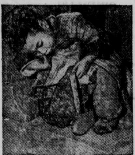
STILL MISERABLE . . . Misery and poverty still are rampant in China. This poorly-clothed, hungry and tired little boy sleeps in the doorway of a Shanghai hotel while his mother begs for coins from American servicemen.

Poland served notice of its determination to permanently affix the new territory at the deputy foreign ministers' meeting in London, called to lay the groundwork for the Big Four conference in Moscow in March to formulate a German treaty. Since given control of the territory at Potsdam, the Poles said they have moved 1,383,000 Germans out and 3,500,000 Poles in.