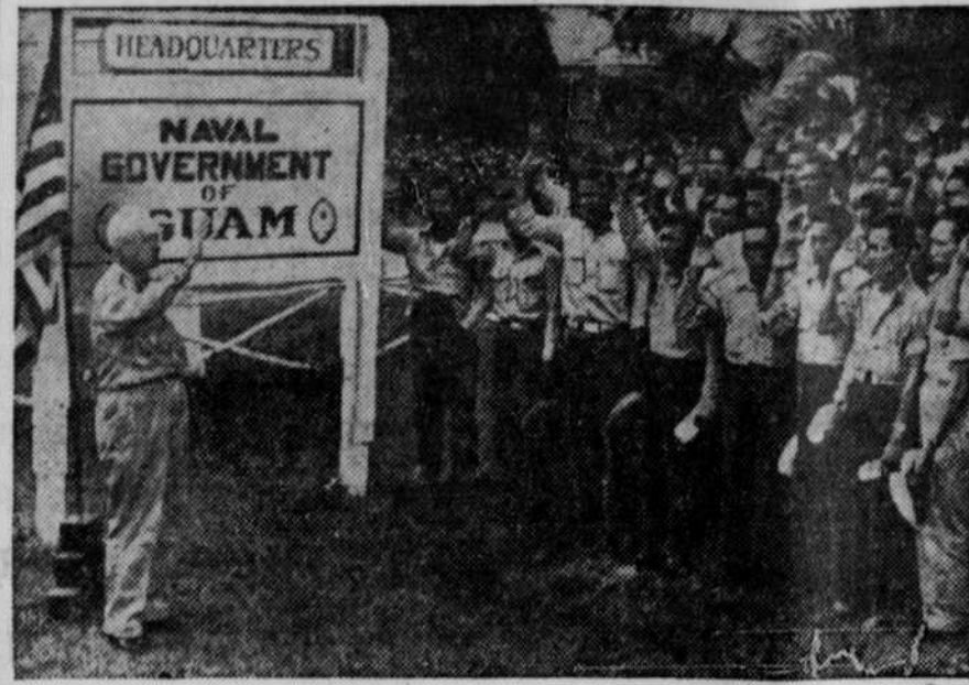
NEW CITIZENS . . . Veterans of Pacific campaigns, 150 alien nationals of the U. S. navy were sworn in as American citizens on Guam. The group was composed of American Samoans, Chamorros and Filipinos. Judge P. J. Phillip of the immigration and naturalization service presided.

The latest bureau of agricultural economics estimate places cash receipts at $24,100,000,000, the highest in history and a 16 per cent gain over 1945. Earlier predictions had forecast only 23 billion dollars, but high prices for meat animals, cotton, feed grains and feed crops