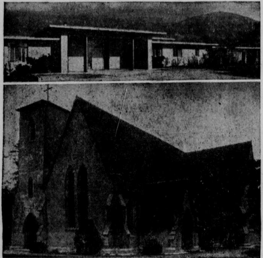
The old and new in rammed earth houses. Top panel shows modern structure at Claremont, Calif. Bottom shows church at Sumter, S. C., which has stood through more than a century.

Merrill's thesis is that anyone willing to acquire the rudimentary