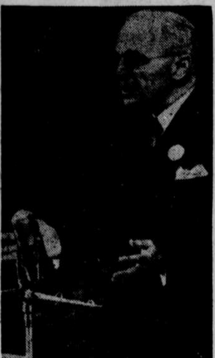
FOR WORLD PEACE . . . Study of President Harry S. Truman as he opened the United Nations general assembly in New York, welcoming the diplomats of 51 nations.