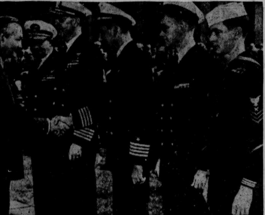
UNIT CITATIONS AWARDED 5 CARRIERS . . . Secretary of the Navy James Forrestal awarded unit citations to five aircraft carriers for inflicting "terrific losses" on the Jap navy during the war. The ships commended were: Cowpens, Enterprise, Hancock, Langley and the Wasp. Forrestal is shown at left. The five other men shown are officers of the aircraft carrier, Wasp.