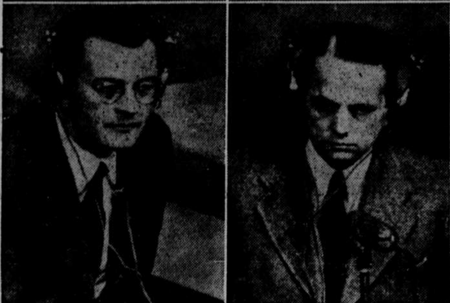
MORE NAZIS FACING TRIAL . . . Here are some of the topflight members of the Nazi regime who still face trial for the part they played in the Nazi gamble for world power. Top left, Field Marshal General Albert Kesselring; top right, Field Marshal General Erhard Milch, who was Goering's air deputy; bottom left, Col. Gen. Von Dem Bach Zelewski, chief of the "Super-Gestapo," and, lower right, S. S. Oberggruppen-Fuehrer Otto Ohlendorf, chief, Nazi secret police.