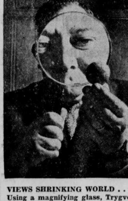
VIEWS SHRINKING WORLD ... Using a magnifying glass, Trygve Lie, secretary general of the United Nations, gazes at a tiny sphere of the world whose peoples are becoming more and more like "next door neighbors." The globe is shrinking due to political considerations and air travel.