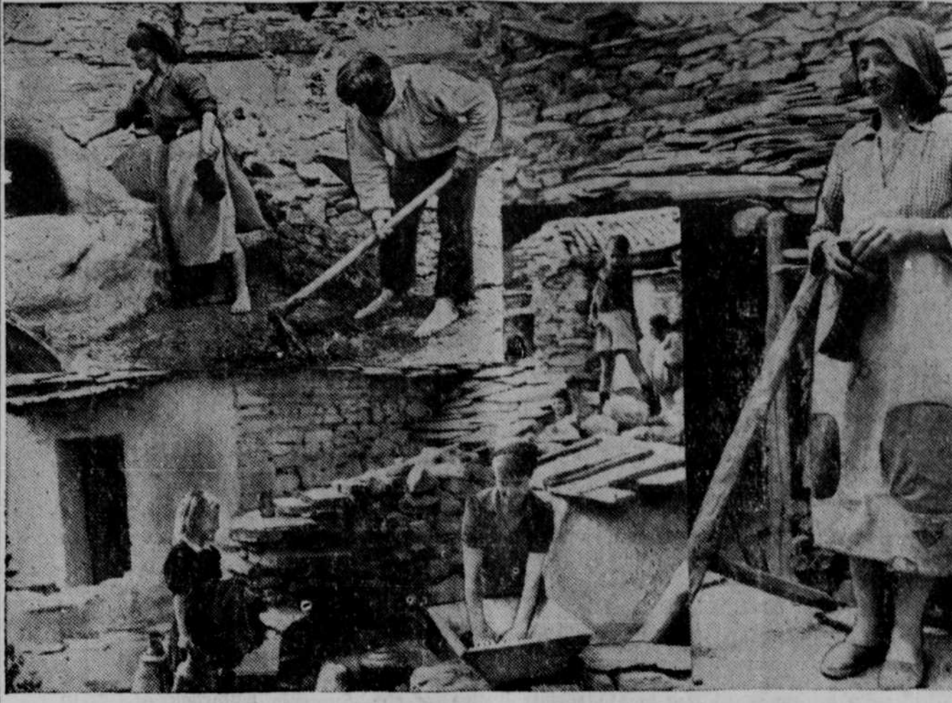
ON WAR'S WINNING SIDE—BUT THEIR BATTLE IS NOT OVER ... Greece, which was on the Allied side in the war, is suffering just as much, if not more, than former enemy countries who were on the losing side. Typical of the little people—the common or average citizen—who are the real sufferers are these citizens at Kanalia, Greece. Starting from the ground up, in a destroyed city, they are building a new home without money and suitable material. Even their livestock went with the Germans.

There is only one Kem-Tone ... Accept No Substitute!