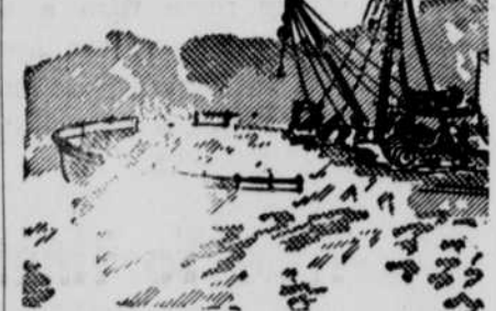
Chart a SAFE course to Debt-Free Farm Ownership by financing your farm land with a long-term, low-interest Land Bank Loan through the