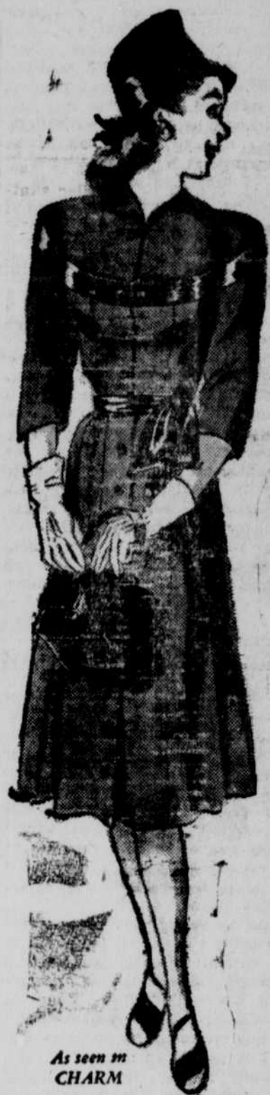
As seen in CHARM

Perfect prelude to that "blessed event" is Doris Dodson's Infadorable of "Evelry cut, softly concealing wonder wool and rayon crepe. Black or beige with black satin trim. Sizes 11 to 17. .... $12.95