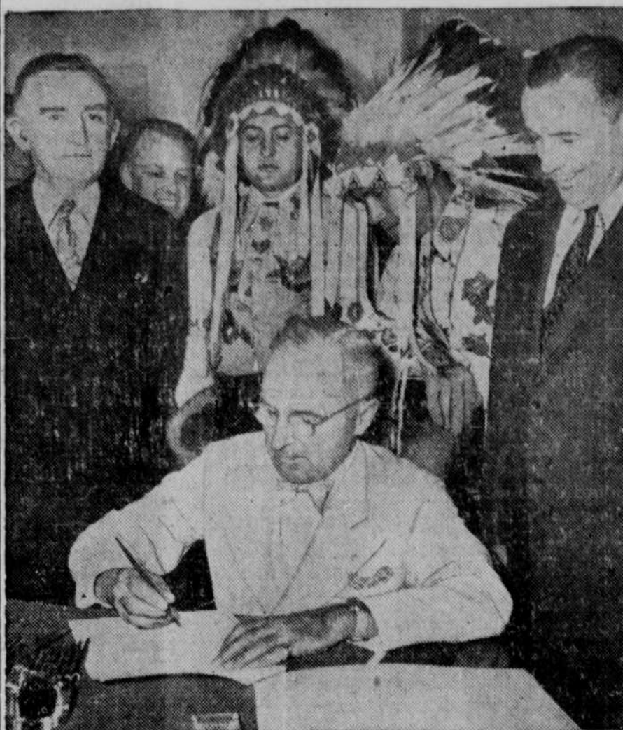
TO SETTLE ALL INDIAN CLAIMS . . . President Truman as he signed a bill creating a claims commission to handle all Indian claims. He expressed the hope that the measure "will mark the beginning of a new era for our Indian citizens."