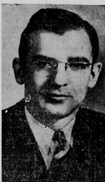
BROKE LA FOLLETTE TRADITION . . . For the first time in 40 years, a La Follette will not be a member of the U. S. senate at next session. This was assured by the defeat of Sen. Robert La Follette by Joseph R. McCarthy, for the Republican nomination. La Follette had recently rejoined the Republican party.