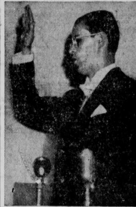
PEREZ TAKES OFFICE . . . Dr. Mariano Ospina Perez, conservative party candidate, is shown taking oath of office to become the first conservative party president of Colombia since 1930. He will serve a four-year term.