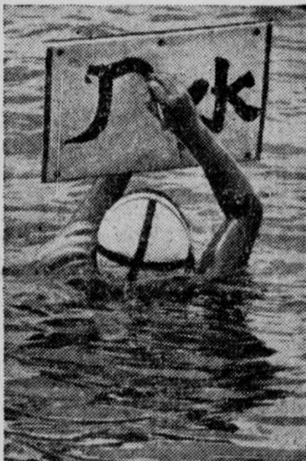
PAINTS WHILE SWIMMING . . . Prince Akahito, 14, who is spending his vacation at the Japanese royal family summer villa, is pictured as he draws while swimming. This is not a show-off stunt but part of his training.