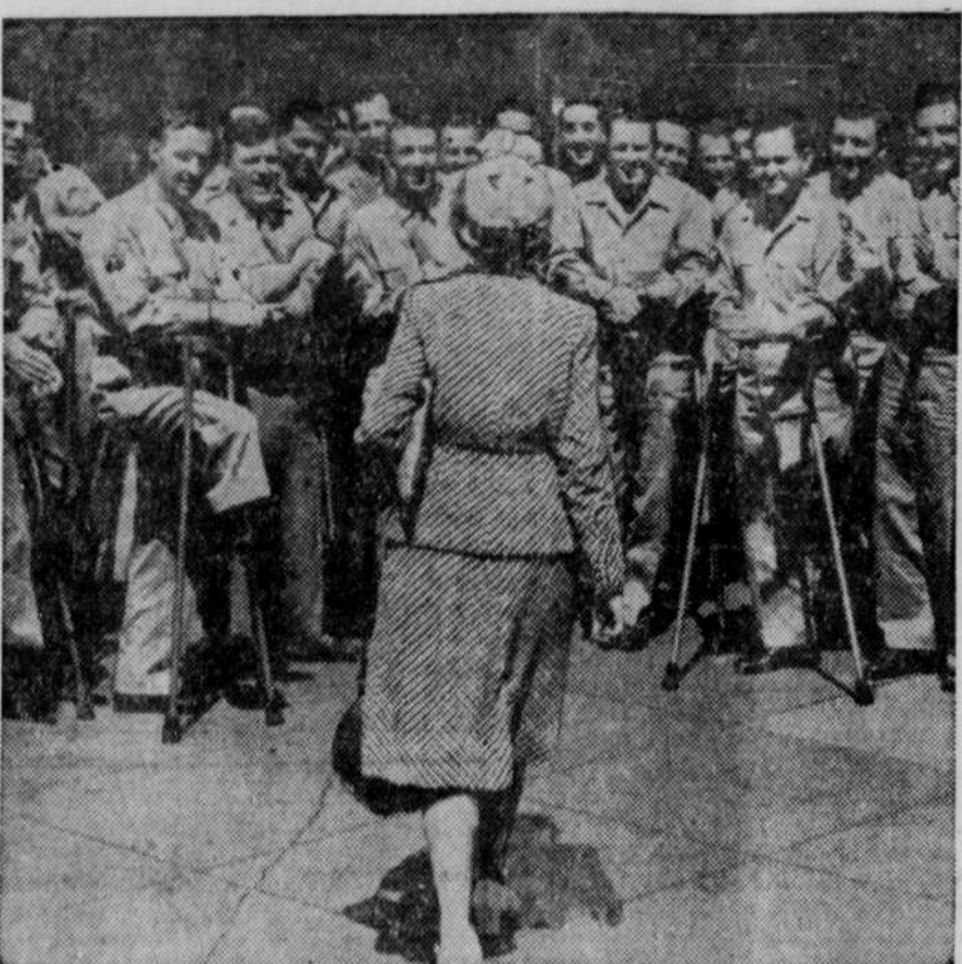
URGE SPECIAL AMPUTEE AUTOS . . . American Veterans' committee representatives and Walter Reed Army hospital amputee committee greet Rep. Edith Nourse Rogers, author of the bill to provide amputees with specially-equipped automobiles. The AVC group told congressmen that 16,000 former servicemen are in the handicapped category and need special cars.