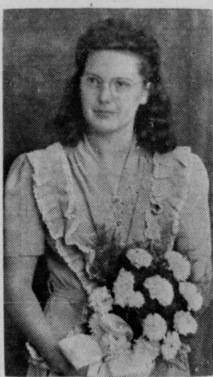
Weds O'Neill Man