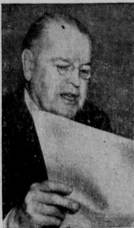
AUSTIN TO UNO . . . Sen. Warren R. Austin, 68, Vermont republican, who has been named by President Truman as U. S. representative of the United Nations security council to succeed Edward R. Stettinius Jr.