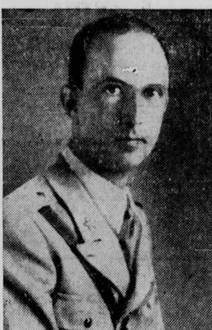
VOTED OUT . . . Portrait of "Umberto" favorite one of King Humbert II, of Italy, whose royal destiny was sealed by the Italian people, who voted him out.