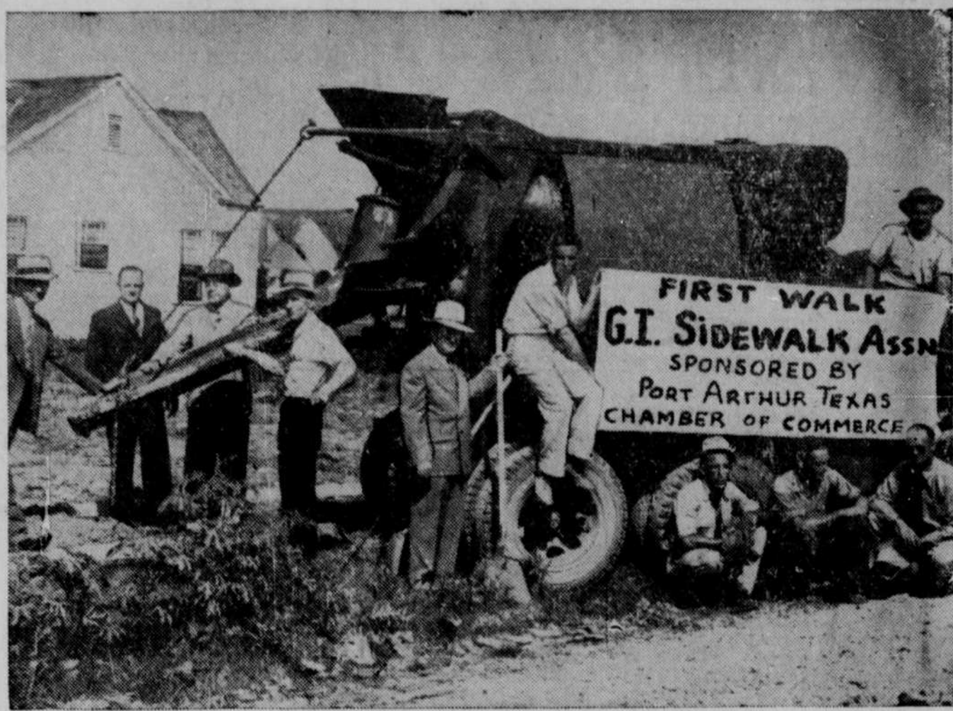
G.I. SIDEWALK ASSOCIATION . . . When the chamber of commerce of Port Arthur, Texas, discovered a large body of unemployed veterans idle and seeking work, it moved to not only employ them but also beautify the city. The ex-G.I.s were formed into a concrete sidewalk laying association. In two weeks a pent-up demand for walks resulted in orders being signed for over 18,000 square feet. The veterans are making up to $12 a day at standard price of 35 cents per square foot.