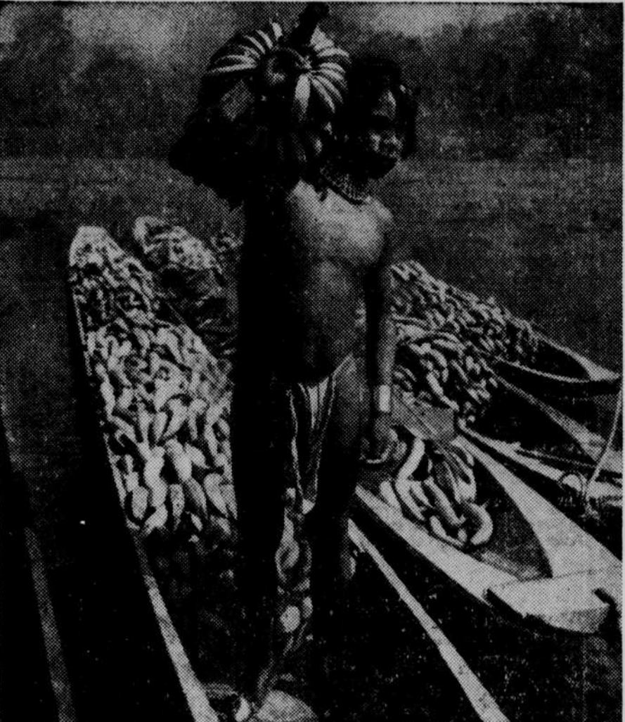
BANANAS FOR AMERICAN TABLES . . . Choco Indian boy with silver bracelets, silver and bead necklace and painted face. The two paints used, black and red, come from the berries of native trees. The dugouts are carved from mahogany. The Choco Indians of Panama are believed to be the Western Hemisphere's wildest living tribe. Each dugout will hold half a ton of bananas.