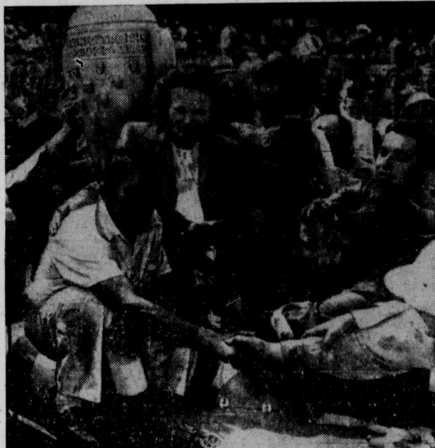
SPEED WINNER . . . A big victory smile shines through grease, grime and sweat as George Robson, Maywood, Calif., is congratulated as winner of 30th annual 500-mile speedway classic at Indianapolis, by his wife, mechanics and friends. Robson was a prewar contender but hard luck usually worked against him. His winning of the first postwar classic places him as the outstanding racing driver of the age.