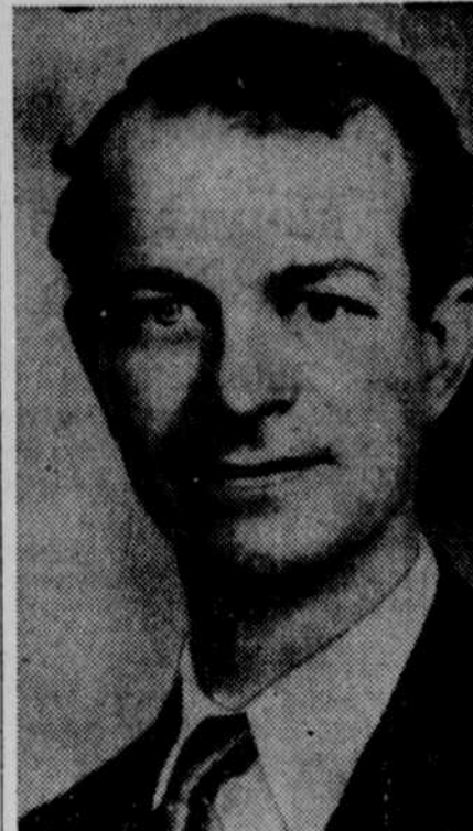
PRODIGY OF SCIENCE . . . Dr. Linus Pauling, California Institute of Technology, who has been awarded the Willard Gibbs medal by Chicago section of American Chemical society. At age of 30, in 1931, he was hailed as a "prodigy of American science." Native of Portland, Ore., he is one of world's leading theoretical chemists. He is a graduate of Oregon State college.