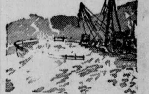
Chart a SAFE course to Debt-Free Farm Ownership by financing your farm land with a long-term, low-interest Land Bank Loan through the