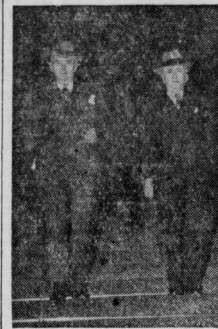
Sen. Vandenberg (left) and Secretary Byrnes leave ministers' session.

The Big Four's foreign ministers, meeting in Paris to speed up the formulation of peace treaties for