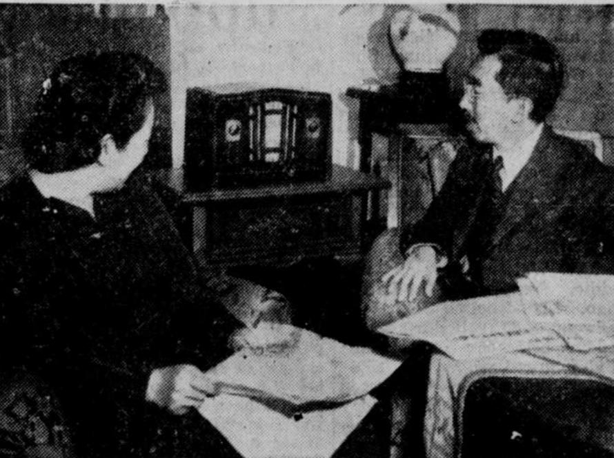
ELECTION RETURNS—AMERICAN STYLE . . . Just as any American couple would sit before the radio to get late returns on election night, Emperor Hirohito, the debunked mikado, and his wife, the empress, sit before the radio and get the latest results of Japan's first democratic election. They are shown at the summer palace at Hayama. Returns continued all election night. Reds filed objection to results.