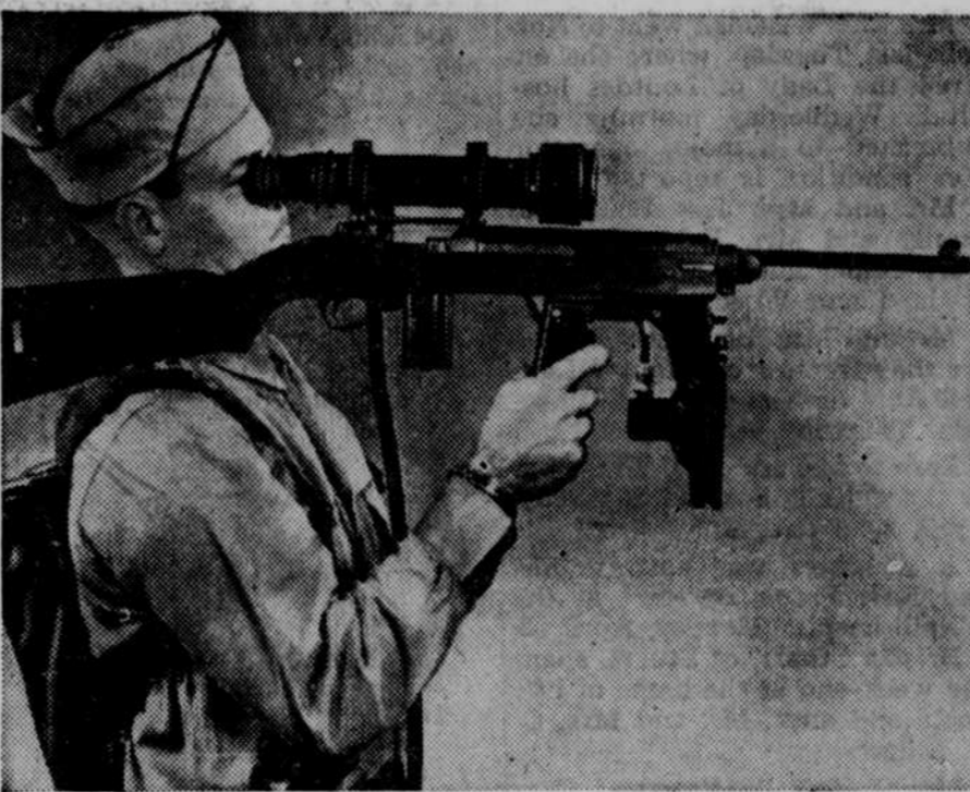
SNIPERSCOPE REVEALED AS SECRET WEAPON . . . A soldier presses the handgrip to turn on the light of one of the U. S. army's most carefully guarded war secrets. The device permits a soldier to see at night by means of an invisible light, infra-red radiation, which casts a beam but cannot be seen by the enemy. It is mounted on a .30-calibre carbine.