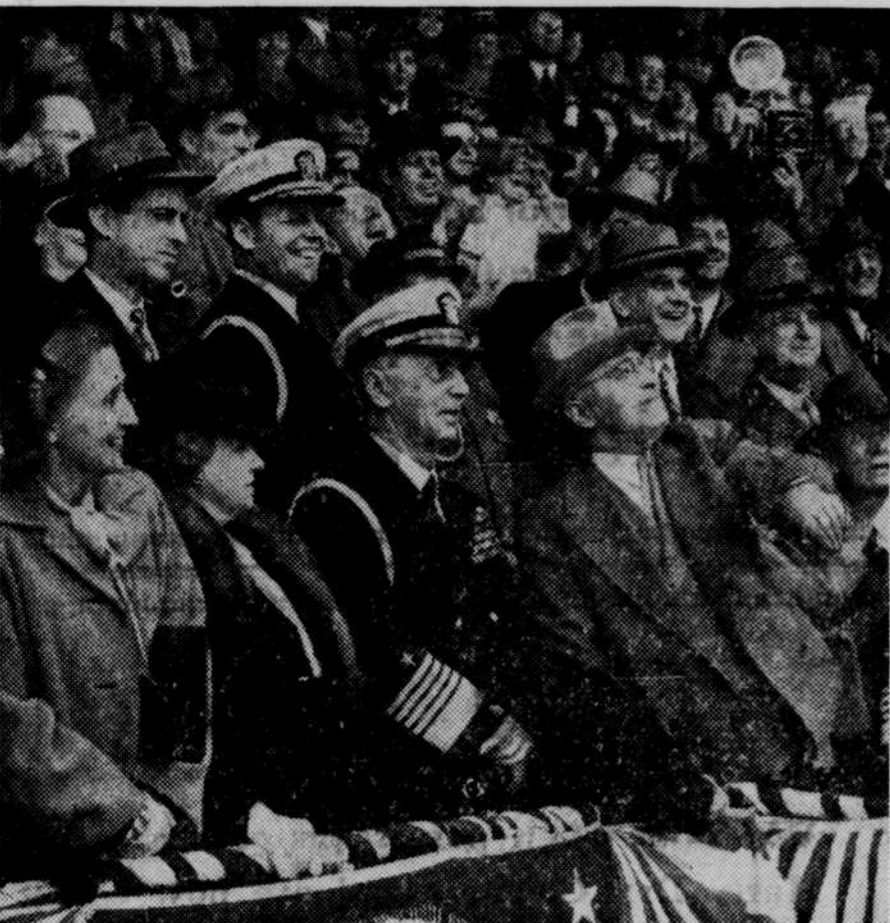
BASEBALL SEASON STARTED . . . President Truman throws out the ball as the 1946 baseball season opens at Griffith stadium, Washington, where the Senators clashed with the Boston Red Sox. Some 236,730 fans thronged eight major league parks for season inaugurals. Along with President Truman, 30,372 fans watched the Red Sox win 6 to 3.