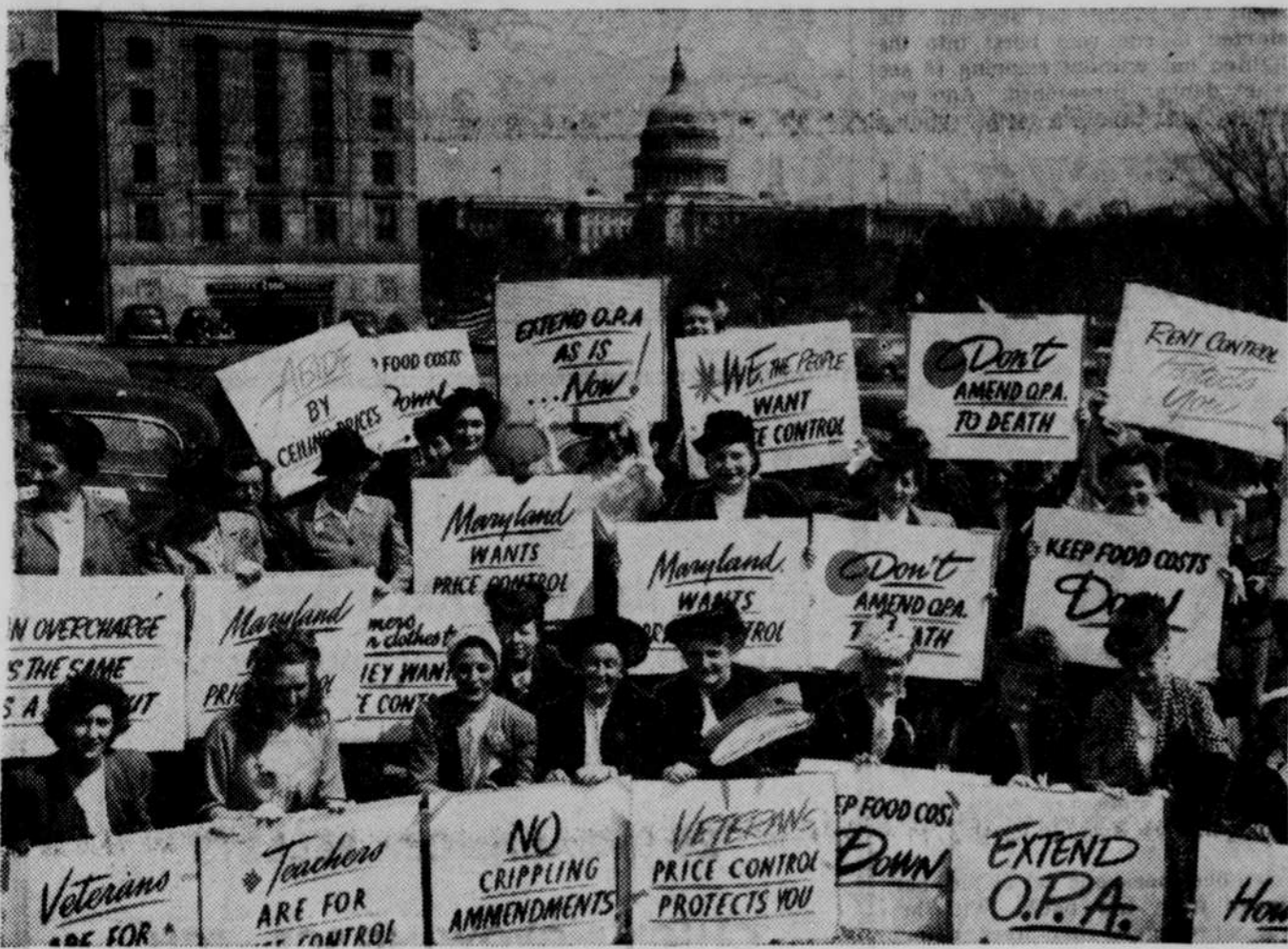
GRASS ROOTS LOBBYISTS URGE OPA EXTENSION . . . Members of a delegation of self-styled "grass roots lobbyists," representing every state in the Union and bearing placards with slogans urging the extension of the OPA while it was being debated in congress, photographed against the background of the great dome of the capitol building, before marching on the hill to button-hole their representatives. After this photo was taken they were joined by representatives of labor and a number of veteran organizations.