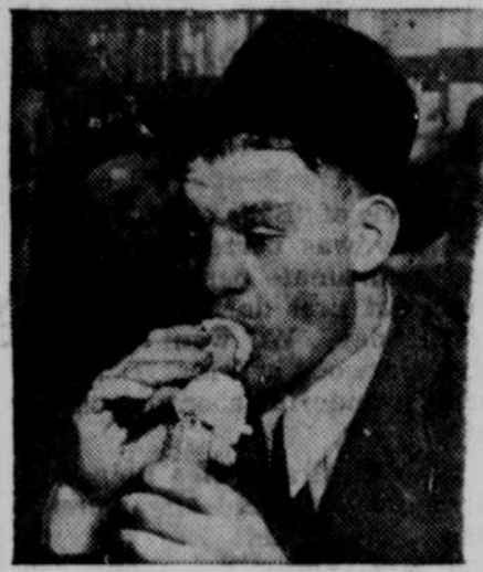
BRITISH CHAMP . . . Bruce Woodcock, British empire heavyweight champ, working on favorite American ice cream cones. He arrived from England for fight with Tan Mauriello at Madison Square Garden.