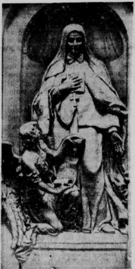
U. S.'s FIRST SAINT . . . This statue of Mother Cabrini, the first American woman to be named for sainthood by the Roman Catholic Church, will be placed in a niche in St. Peter's Basilica upon day of canonization.