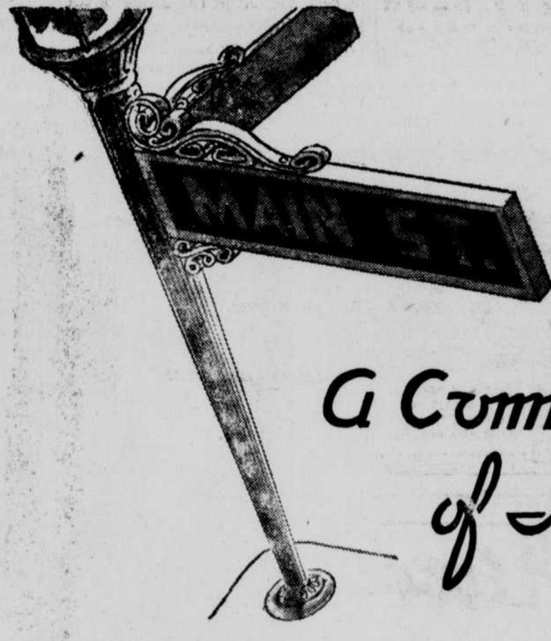
This advertisement sponsored by Conference of Alcoholic Beverage Industries, Inc.

much is being done to help them by finding out and correcting the condition that leads them to excess." GEORGE: "How many folks are there like that, Judge?" OLD JUDGE: "Well, according to scientific research, 95% of the people who drink, drink sensibly, 5% do so unwisely, at times. Included in that 5% is the small percentage of the sick people I'm talking about."