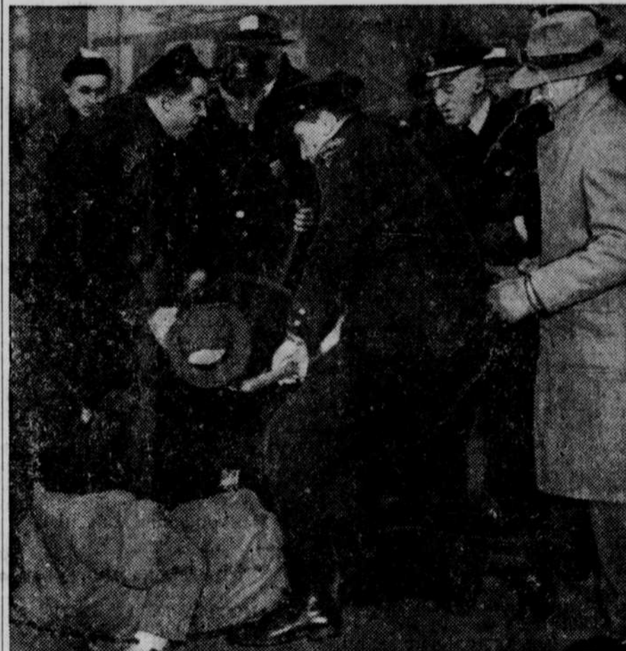
RIOTS DURING STRIKES CONTINUE . . . Representative of other strikes, two pickets and a policeman strike the pavement in the action-packed scene as they clashed in front of the Western Electric company's Kearney, N. J., plant. The police seem to have the situation well in hand. While some strikes have been settled, others have been announced to start during April. Violence has been reported in various parts of the country.