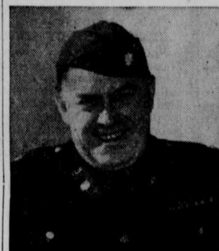
KEEPS CANDIDATE IN ARMY . . . Lt. Col. Harold G. Hoffman, former governor of New Jersey, and again a candidate, received set-back when army ordered him into hospital for observation. He wants to run as a Republican.