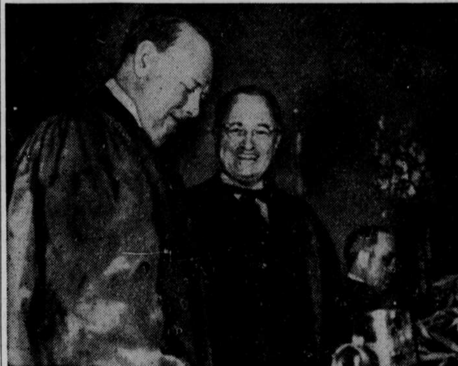
CHURCHILL TALKS WHILE TRUMAN LISTENS . . . Former British prime minister, Winston Churchill, told the audience at Westminster college, Fulton, Mo., that the United States and the British empire should form a military alliance to police the world and to provide a bulwark against encroachments of Communist ideals and ambitions from the East. He recommended that the atomic bomb be kept secret.