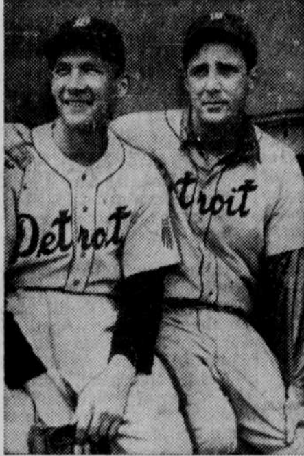
HIGH-PRICED SPARKPLUGS . . . Harold Newhouser, left, pitcher, and Hank Greenberg, star slugger of the Detroit Tigers, shown together during training at Lakeland, Fla. Their combined salaries are said to exceed $100,000.