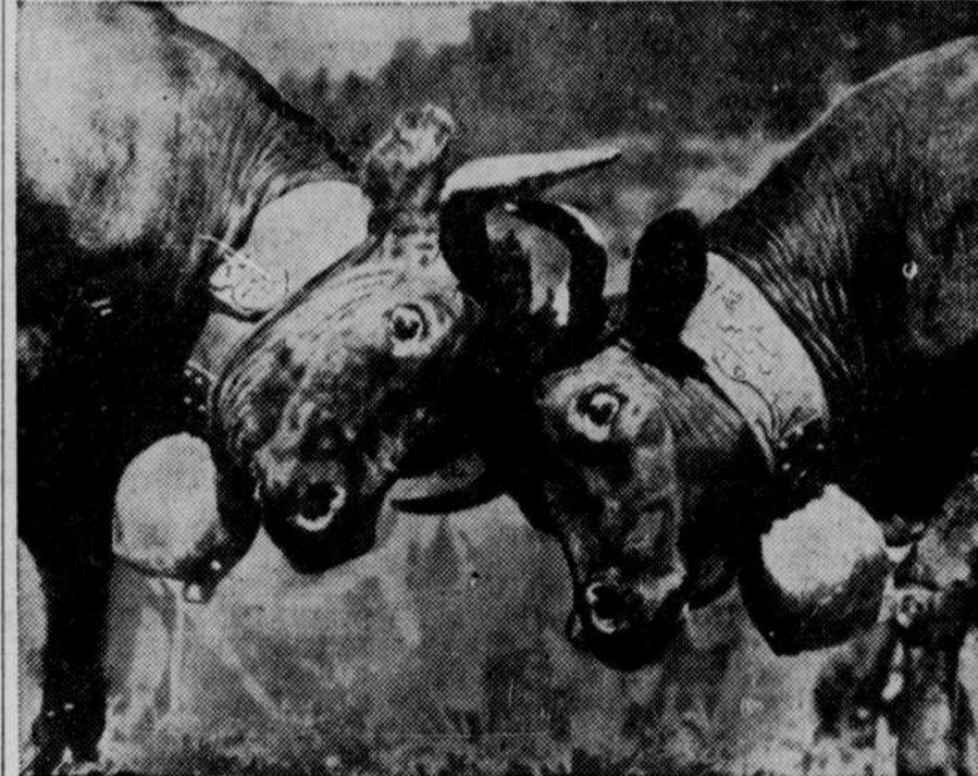
SPRING 'QUEEN OF BOVINES' . . . As a feature of the unique spring celebration held in the canton of Valais, Switzerland, cow fights are held to determine which one will be supreme and be crowned the "queen of bovine queens." Properly organized battle takes place yearly to mark the beginning of spring in Switzerland.