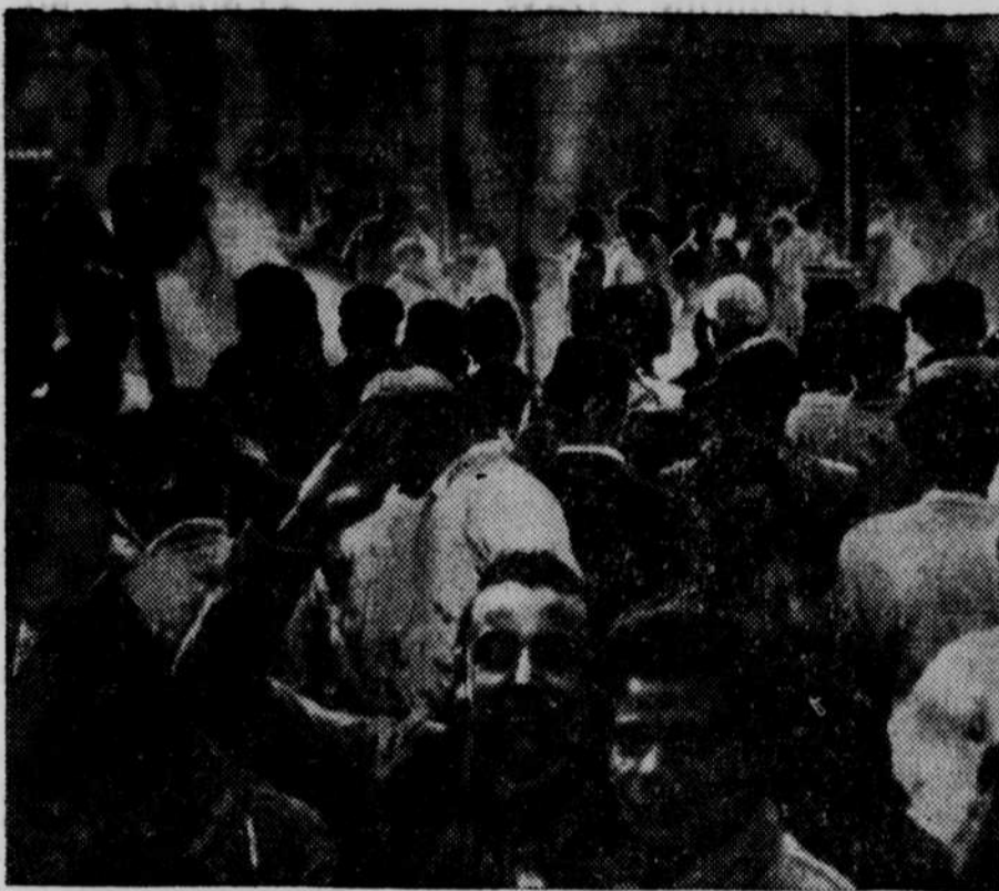
EGYPTIAN STUDENTS RIOT IN CAIRO . . . With demands that the British leave Egypt, students and sympathizers take possession of part of the city of Cairo without opposition from police. The rioters terrorized the capital, many fires were started and considerable damage resulted. Similar riots later broke out in Alexandria, site of a great British naval base. While the riots did not have government backing, little effort was made to prevent or control the demonstrations against the British government.