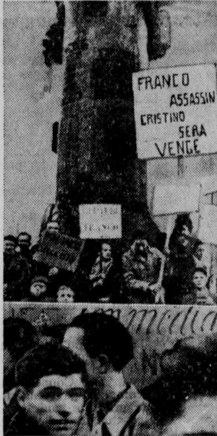
PARIS OBJECTS . . . Against Franco executions of 10 anti-Fascists. This mass demonstration was held in Paris demanding an immediate break with Franco.