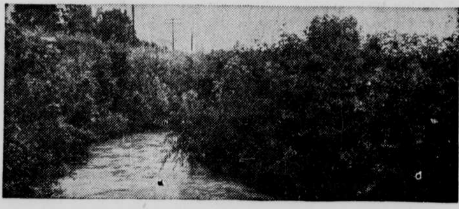
Streams and their steep banks are not suitable for pasture or cropland. It is much better to plant a broad strip along each side of the creek with clover or other rough, strong cover. Some willows or other trees that thrive near water should be set out too, both for cover and to help keep the banks from washing away. In Illinois and northern Indiana great areas of marshland were returned to their natural state after many unsuccessful years of attempted farming.

been particularly interested in land use on the theory that if land and water are utilized properly we will automatically have wildlife. Clinton R. Gutermuth, executive secretary of the institute, who occupies a mod-